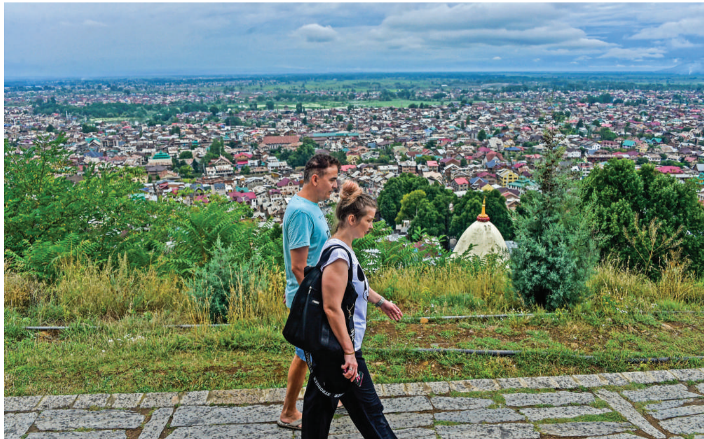
With the old city of Srinagar in background, a tourist couple takes a walk around Hari Parbat fort on a rainy Wednesday afternoon.

On Tuesday, 26 opposition parties announced the formation of their coalition - Indian National Developmental Inclusive Alliance More on P6