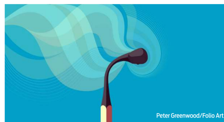
Peter Greenwood/Folio Art

It has resulted in drained brains who have ceased to work and are unable to think logically and creatively.