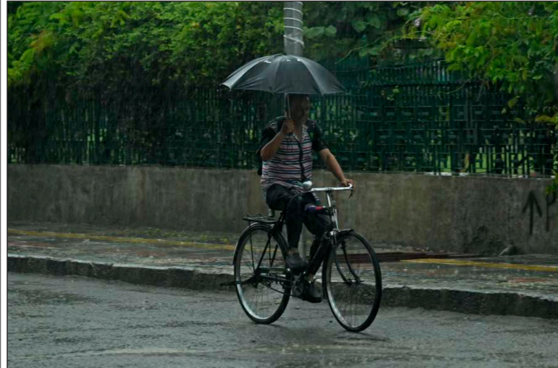
Holding an umbrella, man rides a bicycle in Srinagar amid heavy downpour on Wednesday.

They stressed that immediate action is needed to find a permanent solution to the issue so that such problems are not repeated in the future.