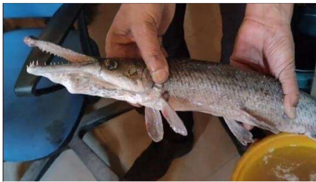
Recently discovered alligator gar, a non-native predator fish mostly found in North America, in Srinagar's Dal Lake

Kashmir's water bodies receive little respect and are under the constant out-