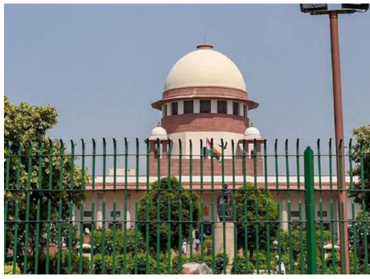
Court," the Collegium said.

"In terms of the Memorandum of Procedure, judges of the Supreme Court conversant with the affairs of the High Court of Bombay were consulted to ascertain the fitness and suitability of the candidate proposed for elevation to the High