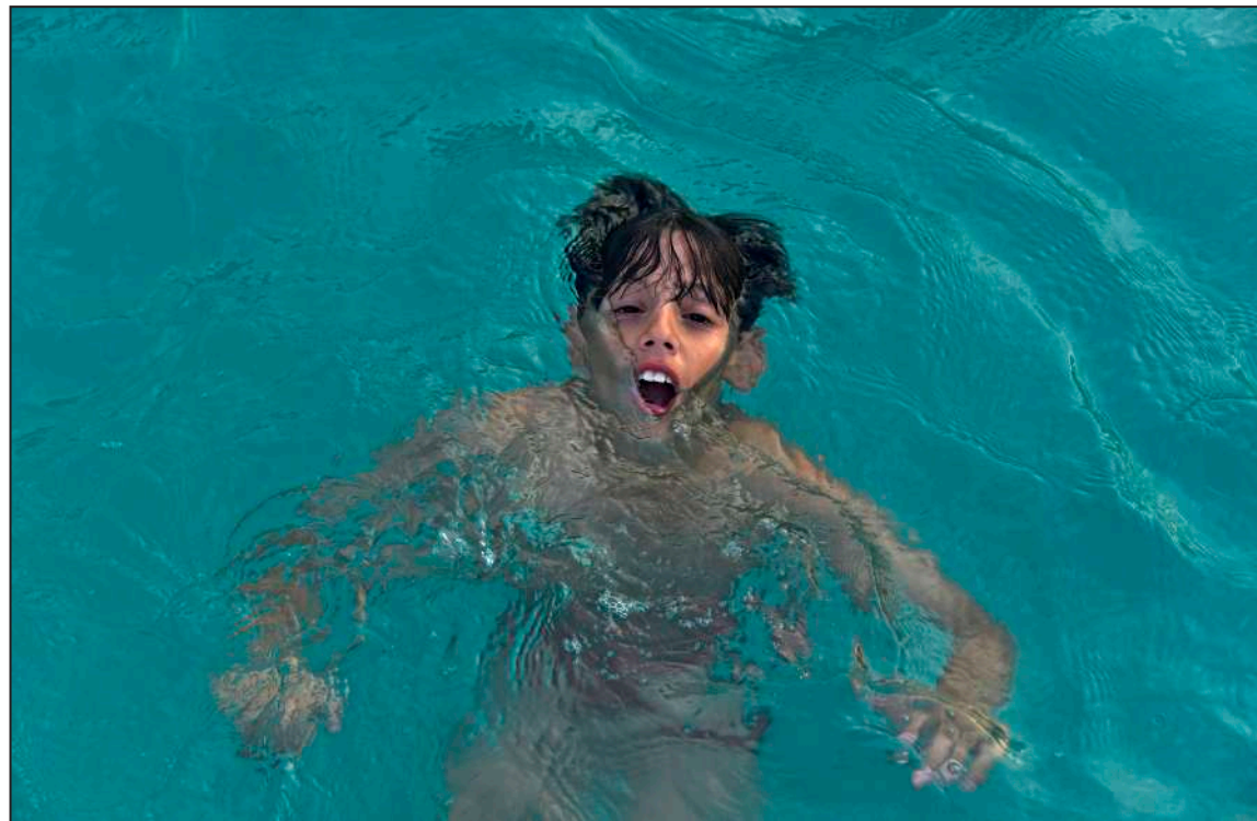
Boy takes bath in a swimming pool amidst scorching heat in Srinagar on Tuesday.

Notably, after reports of a leopard sighting near In Badamwari Park on Monday evening, Srinagar police asked the locals of the area to remain indoors and not venture out unnecessarily.