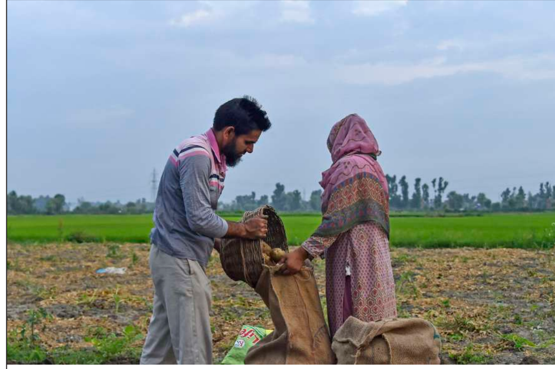
Amid scroaching heat, farmers pack raw potato stock in large bags on the outskirts of Srinagar on Monday.