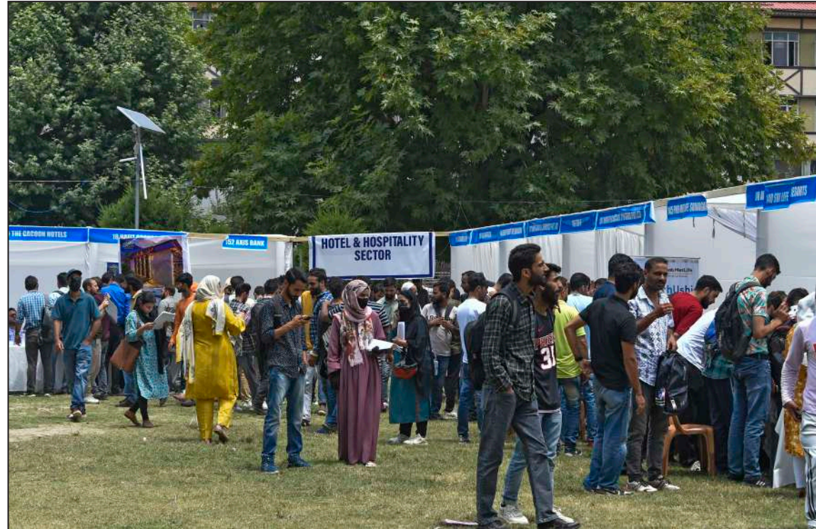
Day long Job Fair organized by the Directorate of Employment in collaboration with Desh Bhagat University Punjab at Kashmir Haat witnessed overwhelming response from job seekers on Saturday.

"We are poor and middle-class families here; we cannot afford to pay hefty bills generated by these smart meters. It is totally unacceptable," they said.