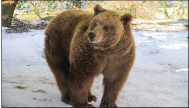
Similar encounters have been reported in villages such as Behnipora, Budshungi, and Shatigam, where residents

Srinagar: Highlighting the escalating conflict between humans and wildlife, the Jammu and Kashmir Wildlife Department in an incident in May successfully captured a Himalayan brown bear in a village in North Kashmir. The bear's behavior had become increasingly weird as the bear raided graveyards possibly in search of human carcasses and venturing into residential areas of Handwara, posing a threat to lives and livestock.