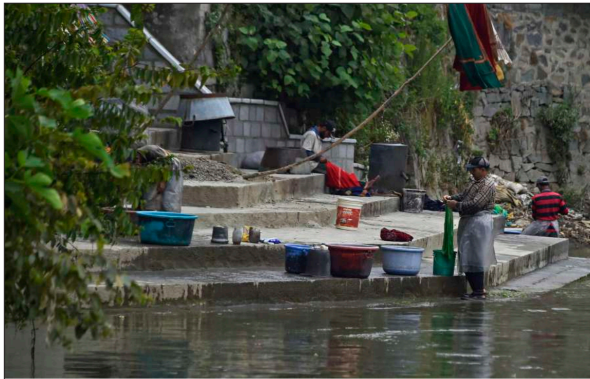
A washerman (dhobi) washes Kashmiri embroidered shawls in a traditional way on the banks of River Jhelum in the old city.

ceptable to them and that they won't allow authorities to install these devices. A resident from Rainawari said, "We are a middle-class family and don't have that much money to pay for these meters. Those meters which have already been installed in our areas must be removed." "I am a poor and middle-class woman. Currently, we receive an electricity bill of 920 to 950 rupees per month. We are ready for even Rs 1,100 as a flat rate but not these meters," said a lady. On Wednesday, people were seen shouting and dancing on roads to register their protest against the power department in the Sopore area of Baramulla district.