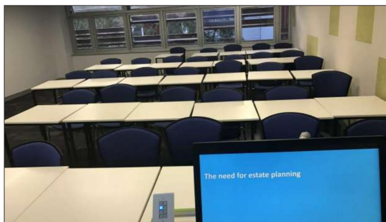
Empty Classroom. Photo for representational purposes only

The government's digital interventions to upscale digital infrastructure such as National broadband mission, Digital India, Bharat net along with telecommunication driven digital revolution have made it possible to reach out to the sections of the student community which were previously inaccessible to online teaching platforms either due to non-availability of smart electronic gadgets or weak network penetration. UT level administration in general and department of Education in particular have undertaken certain desired digital interventions like establishment of sophisticated ICT labs in high and higher secondary schools with round the clock high speed internet facility. In some schools, even digital tablets have been pro-