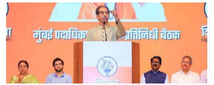
Press Trust of India

NEW DELHI: The Shiv Sena (UBT) has once again knocked on the doors of the Supreme Court, seeking direction to the Maharashtra assembly speaker to expeditiously adjudicate the disqualification petitions filed against Chief Minister Eknath Shinde and other Sena MLAs, who had tied up with the BJP to form a new government in June 2022, in a time-bound manner.