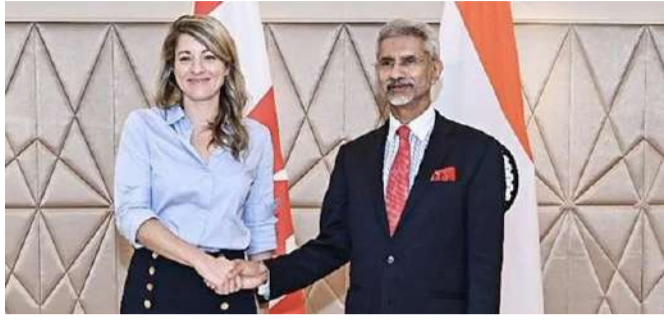
Press Trust of India

TORONTO: Canada has assured India of the safety of its diplomats following the circulation of Khalistani posters online which named Indian officials and termed the "promotional material" circulating ahead of a Khalistan rally "unacceptable".