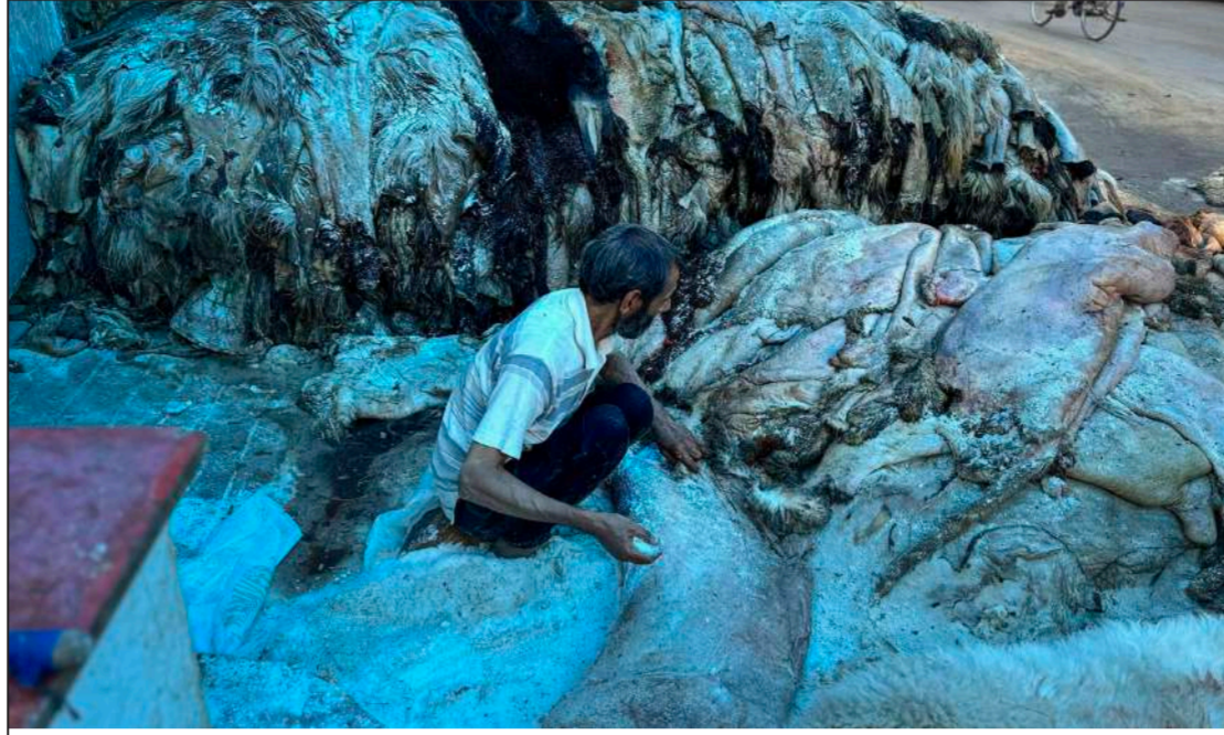
A worker applies salt on the hides of sacrificial animals to inhibit the growth of bacteria on it at Jamalatta area in the old city on Monday.

The officials said they had placed all arrangements for visitors including the convenience facility, drinking water facility, availability of dustbins, wheelchairs for the specially-abled, etc. There are many parks and gardens in the valley under the supervision of the Floriculture Department where public entry is free.