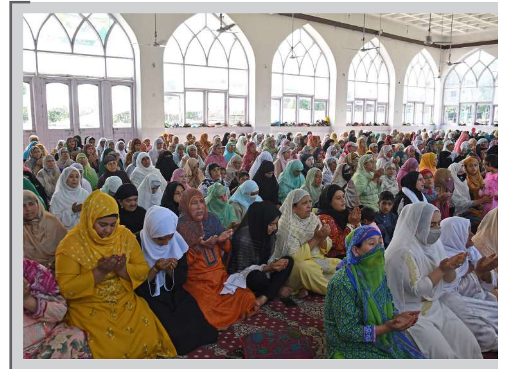
THE BIGGEST CONGREGATIONAL PRAYERS on Eid-ul-Azha were held at the Hazratbal Shrine, where more than 50,000 devotees, including women gathered.

Secretary. Those who were present during this event includes Principal Secretary, H&UDD; Commissioner JMC; CEO, JaKeGA; Scientists from NIC and other concerned officers.