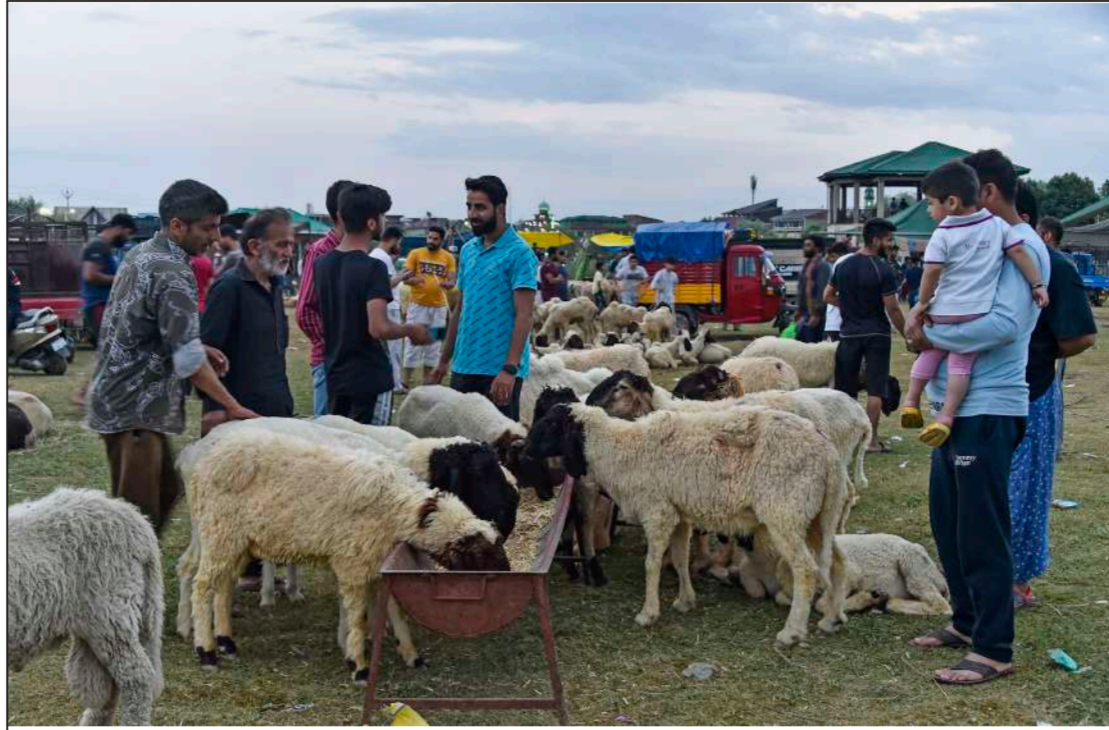
People were busy buying sacrificial animals at largest Mandi in Eidgah area of Srinagar ahead of Eid-ul-Adha (feast of sacrifice) on Monday.

"Regional Transport Officer, Kashmir, SSP Traffic City and SSP Traffic Rural are also requested to intensify the surprise checking of bikes Scooty riders and intercept the minor students who don't wear helmets or don't have driving licenses and are below the age of 18 years so as to curb this menace with iron hand and ensure rule of law and rules of traffic are observed by one and all religiously," it reads. KNO