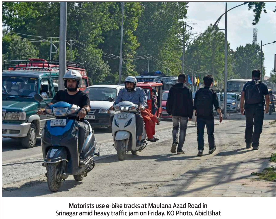
Motorists use e-bike tracks at Maulana Azad Road in Srinagar amid heavy traffic jam on Friday.

Police officials said that the investigation is underway in the case.