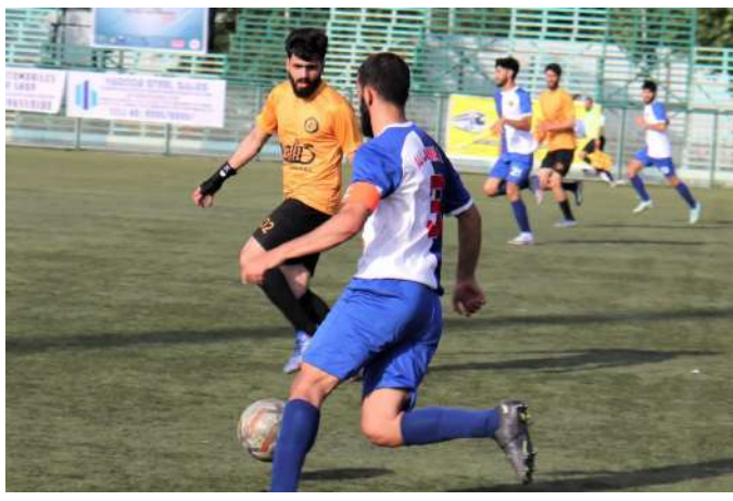
2023 SRINAGAR PREMIER LEAGUE