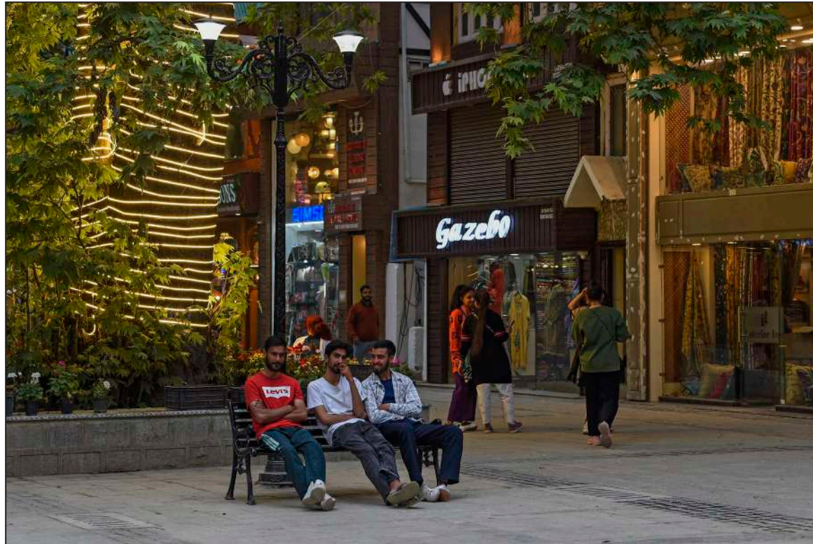
People relaxing under a lit up chinar at newly renovated Polo-View Market in Srinagar.