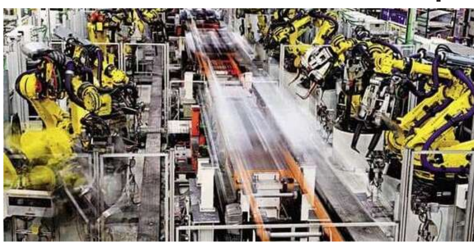
Press Trust Of India

NEW DELHI: India's industrial production growth rose to 4.2 per cent in April from 1.7 per cent in March 2023, mainly due to good performance by the manufacturing and mining sectors, according to official data released on Monday.