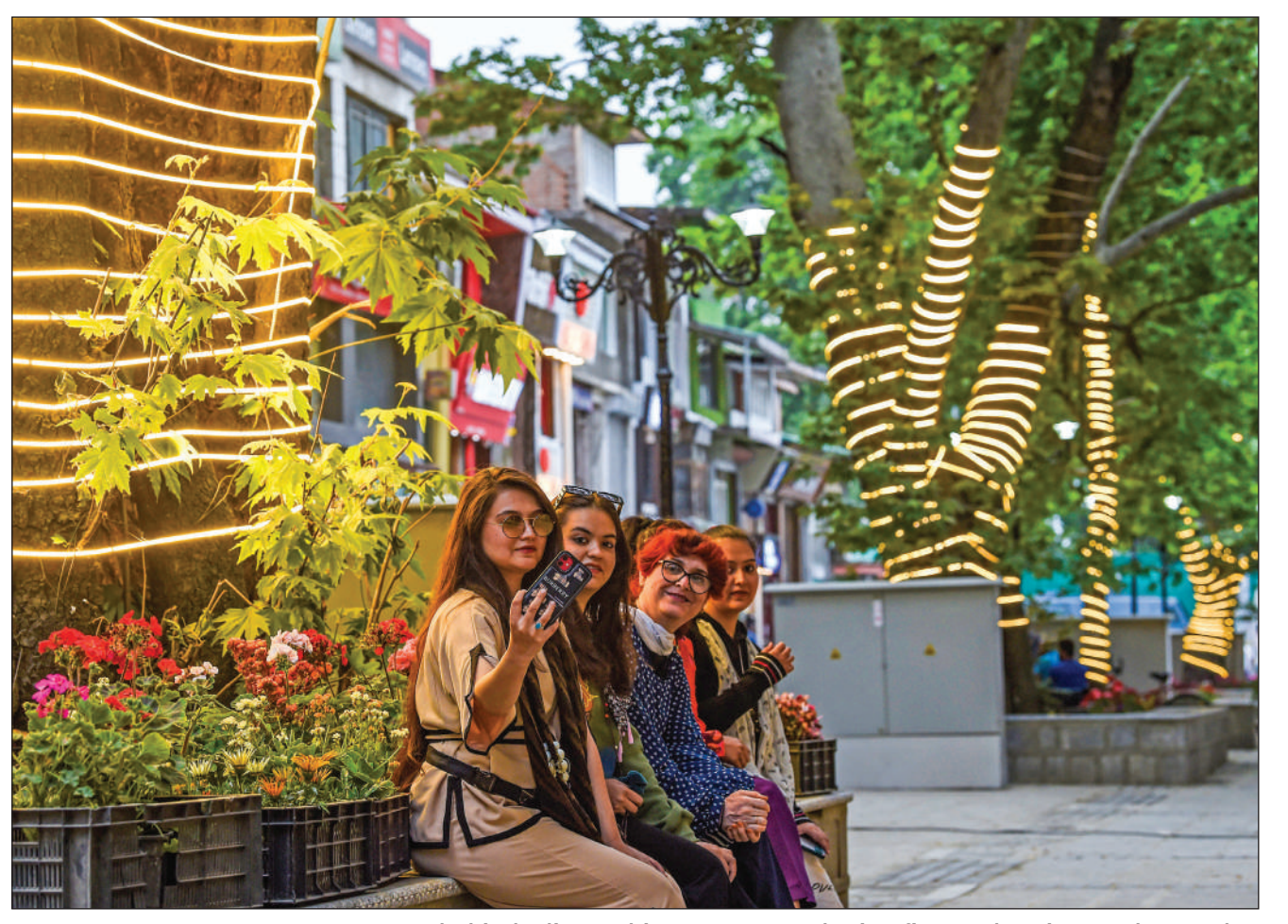
FEMALE TOURISTS TAKING A SELFIE behind a lit up Chinar tree at Kashmir's first pedestrian market - Polo View in Srinagar city on Monday.

"We got the award roll lately from their respective schools and that's why this issue occurred. There was no fault of BOSE in it," the official said—(KNO)