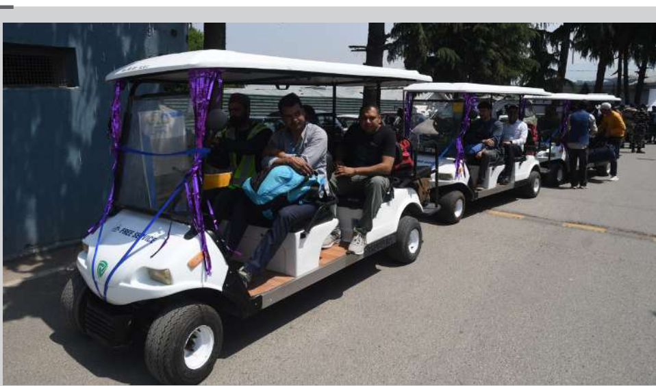
AIRPORT AUTHORITY OF INDIA has introduced e-carts to provide "drop and go" facility at the entry to the Srinagar international airport to address "long standing" grievances from passengers about delays and hassles at the Airport..