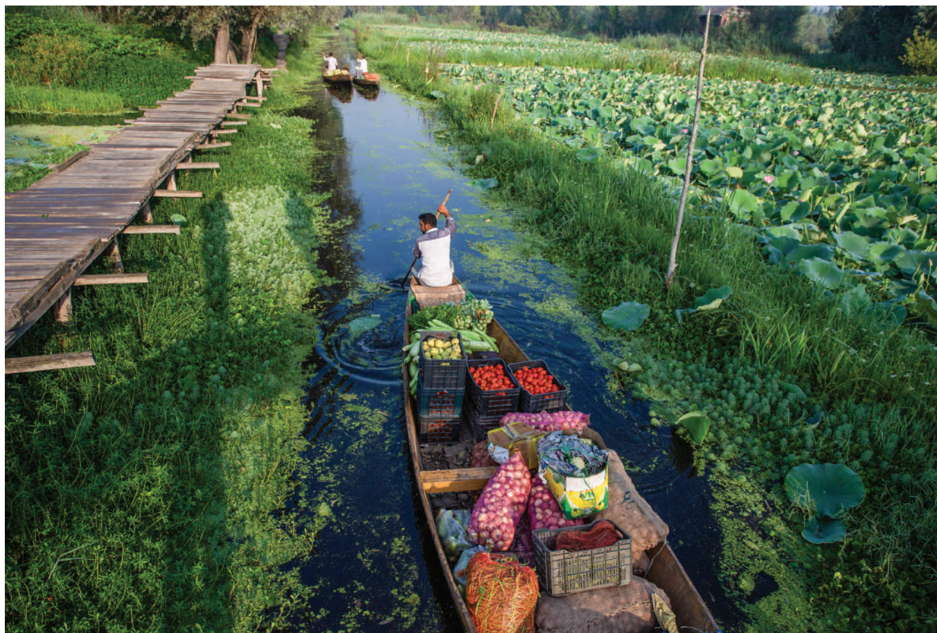
A farmer carries his fresh stock of vegetables in his boat to sell at the vegetable market in the middle of Srinagar's Dal Lake.

When the cloud storage of the accused was More on P6