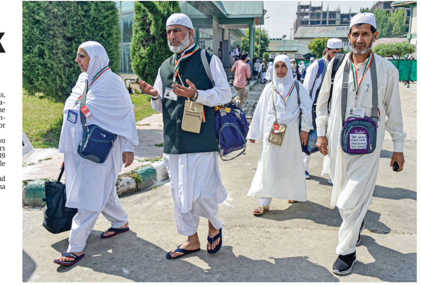
Emotional scenes were witnessed on Wednesday as the first batch of pilgrims from Jammu and Kashmir left for Hajj Pilgrimage to Saudi Arabia from Srinagar International Airport.

recreational facilities, stress management, counseling, social support, legal assistance, medical assistance More on P10