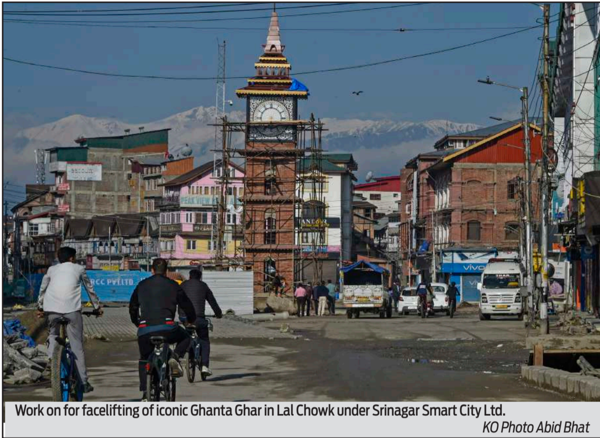
Work on for facelifting of iconic Ghanta Ghar in Lal Chowk under Srinagar Smart City Ltd.

Speakers on the occasion said that drug addiction is an issue of grave concern, especially among the younger generation and has very ill effects not only on the individual concerned but on the society as a whole.