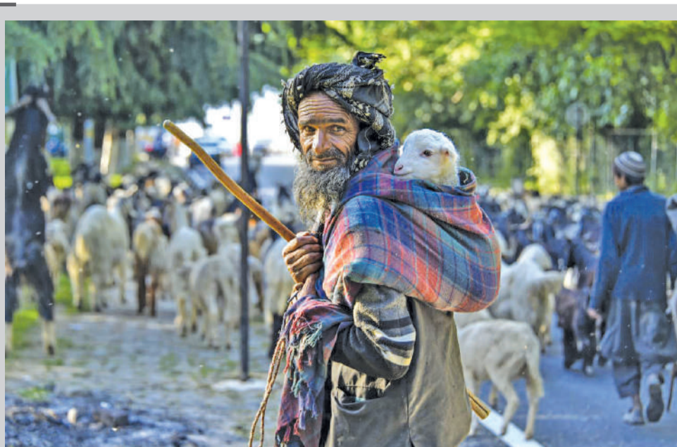
KEEPING THEIR CENTURIES OLD TRADITION alive and with rise in daily temperature, the bi-annual seasonal migration of Gujjars and Bakerwals from Jammu's forest plains to Kashmir's high pastures is in full swing.

For program details and online submission of admission forms students are advised to visit the University website www.bgsbu.ac.in .