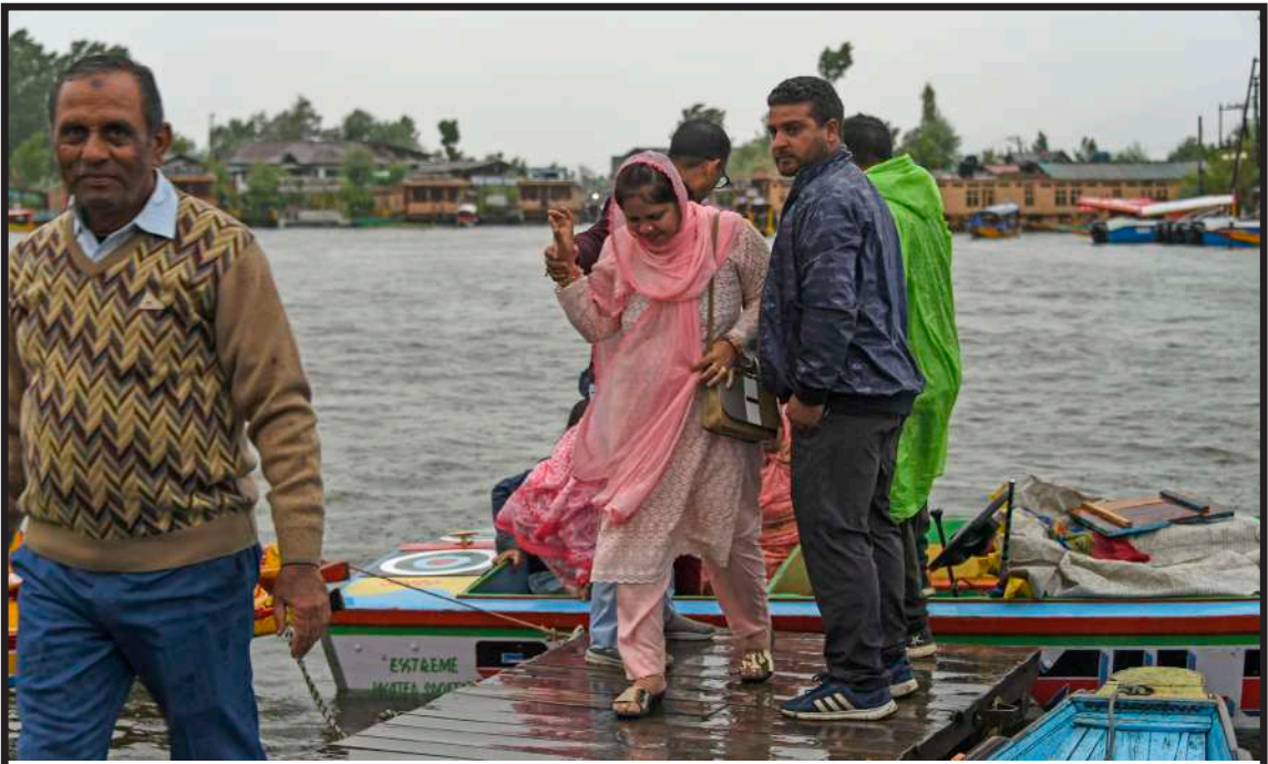
River police rescued 21 tourists who were stranded in Dal Lake amid gusty winds and heavy rainfall on Monday evening.