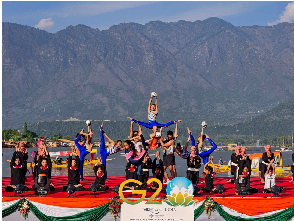
Performers during a special sports event at Dal Lake ahead of G20 meet

Singh also said that G20 member countries, invited countries, and international organisations will give valuable