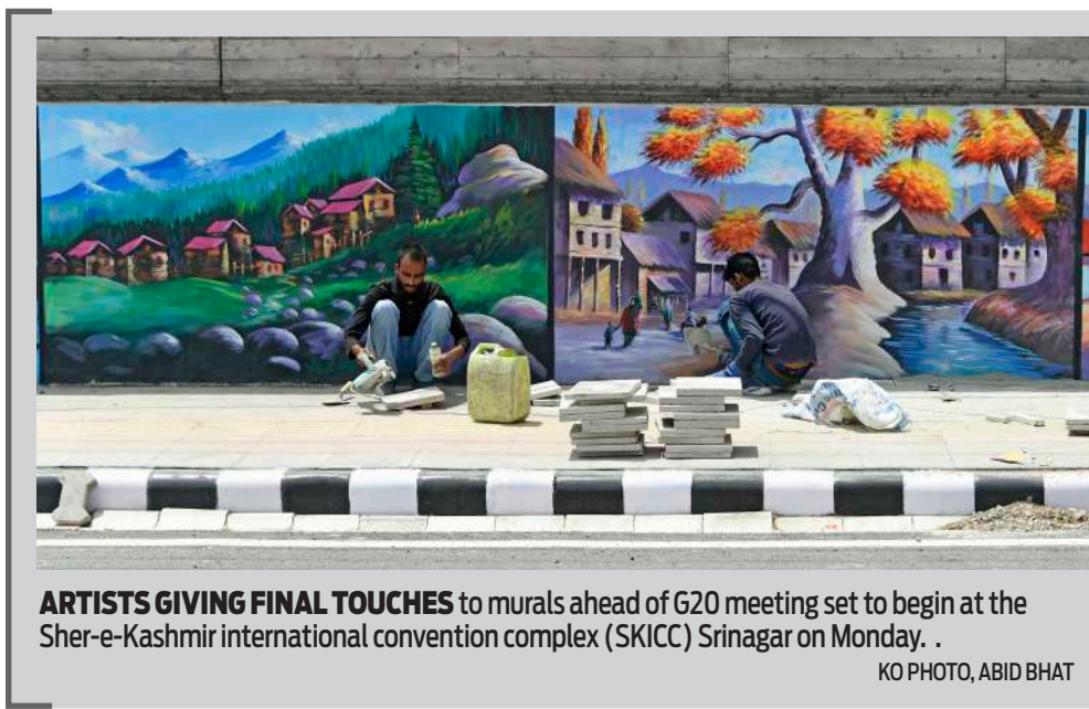
ARTISTS GIVING FINAL TOUCHES to murals ahead of G20 meeting set to begin at the Sher-e-Kashmir international convention complex (SKICC) Srinagar on Monday. .

Placement of female GNM and Staff Nurses in Dr Suliman AL Habib Medical Group through AL Yafur Travels Consultancy was also taken into consideration on the occasion.