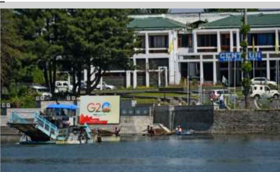
MEN AND MACHINERY OF JAMMU AND KASHMIR Lake Conservation and Management Authority (LCMA) continues its ongoing drive to clean Dal Lake near the SKICC, the main venue of the upcoming G20 meeting in Srinagar.

Others present on the occasion were Deputy Commissioner Udhampur, Deputy Commissioner Ramban, SSPs Udhampur and Ramban, PRI representatives besides others.