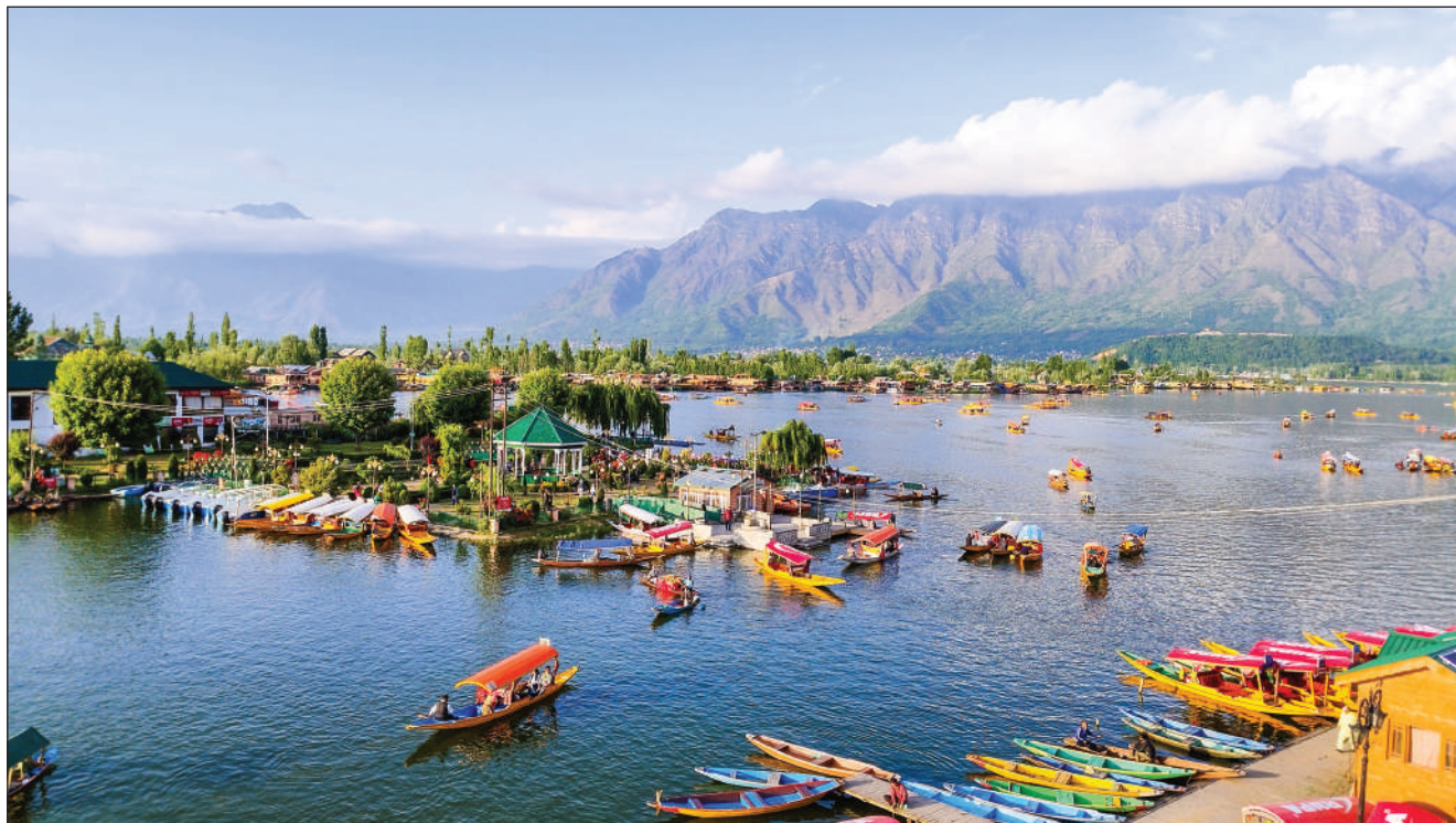
A panoramic view of Dal Lake as captured by lensman Mushtaq Reshi on Thursday.

They said that it was done by the employees of the block and there is need to check whether other officials are also involved in it as they are supposed to release the amount only after proper ground verification of the ground. More on P6