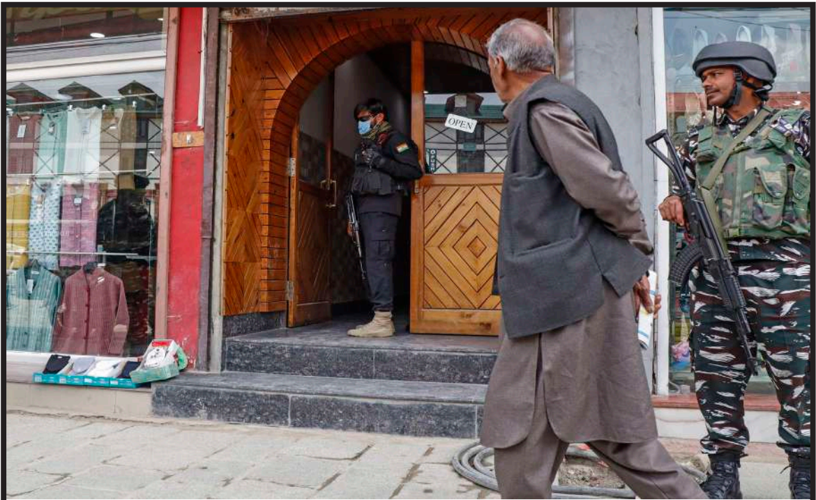
Amid ongoing projects being undertaken under Srinagar Smart City Ltd, NSG commandos carried out area domination in Lal Chowk two days ahead of proposed G20 meeting in Srinagar.

Speaking on the occasion, the Principal of the College directed the NSS volunteers to take the campaign beyond the boundaries of the college and involve people from other institutions to strengthen the campaign.