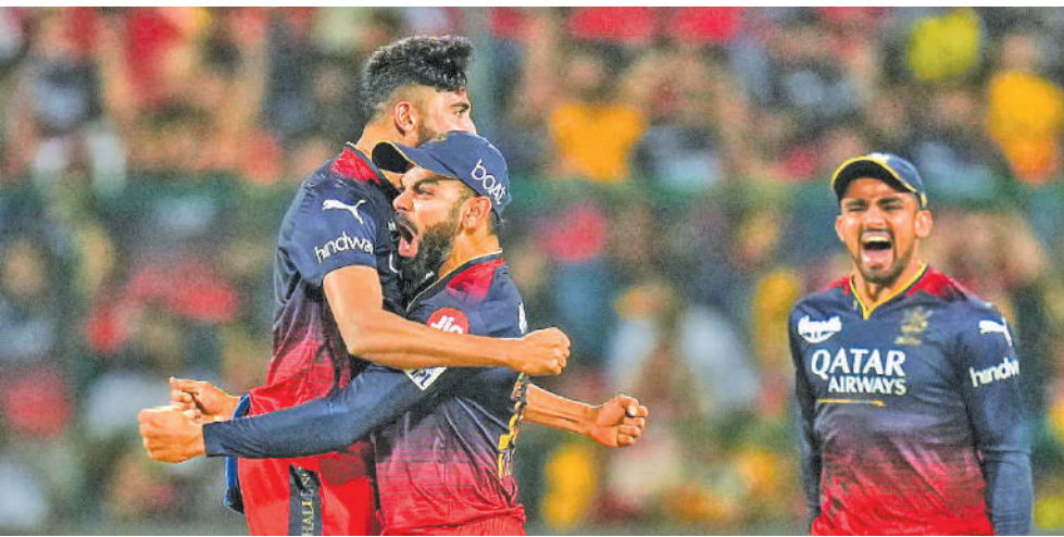
Press Trust of India

in connection with the G20 Meeting. Starting from Indoor Stadium the race culminated at GHS Rawalpura. More than 1100 student-athletes from different government and private schools of Srinagar participated in the road race. YSS also organized various events in different sports zones of Anantnag district. Sports Zone Mattan hosted One Day Trekking Camp for students and also invited international Wushu player Tanzeel Ahmad Shah as a special Guest of Honour to interact with students and motivate them. A running event was organised from Bumzoo to Sports Stadium, Mattan.