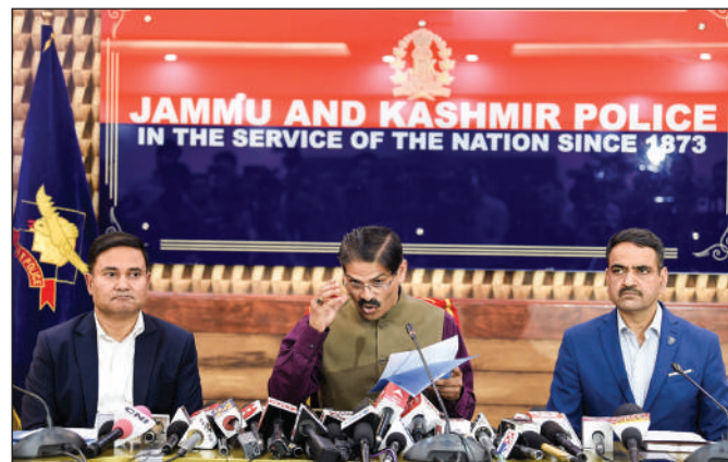
KO Photo | Abid Bhat