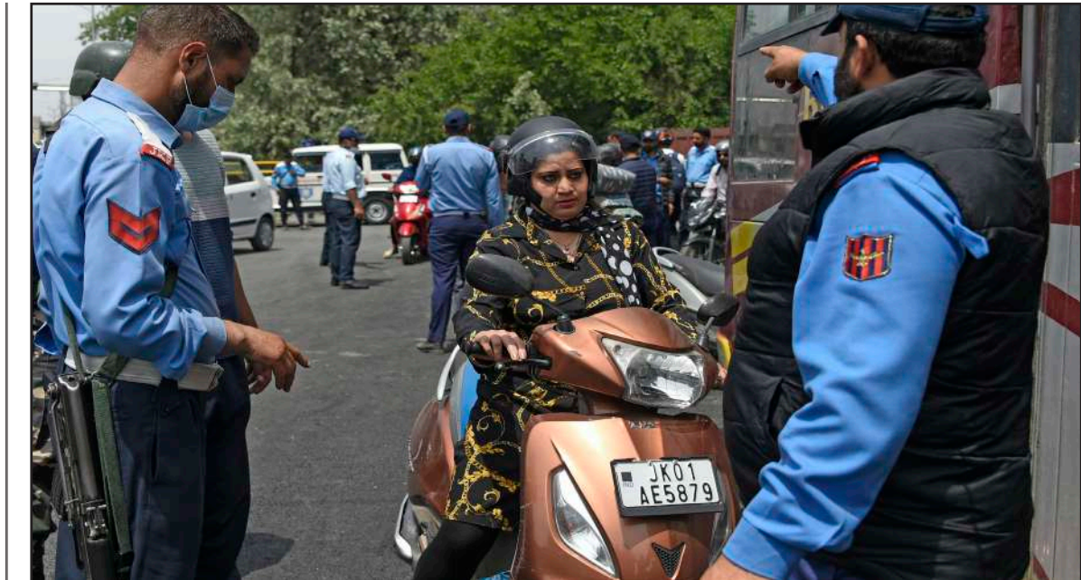
Traffic Police Department seized dozens of two-wheelers as part of special drive against violators in Srinagar on Tuesday.