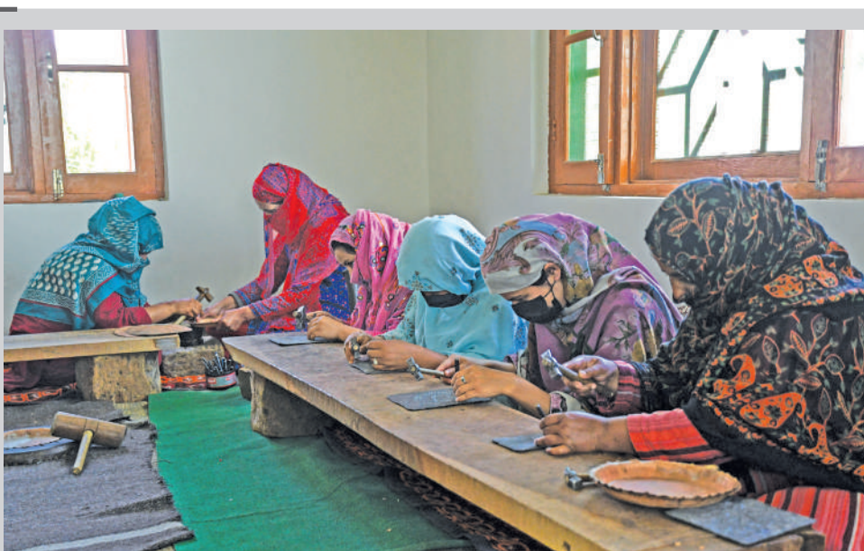
A GROUP OF WOMEN BEING trained in making copper utensils by the Jammu and Kashmir government's handicraft department at a centre in Srinagar.