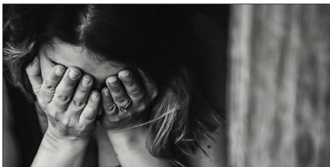
Since its launch, the call centre has received more than 10,000 calls. "About 70 per cent of those calls were from

The call centre under the central government's Tele MANAS initiative was established at the Institute of Mental Health and Neurosciences in Rainawari here in November last year.