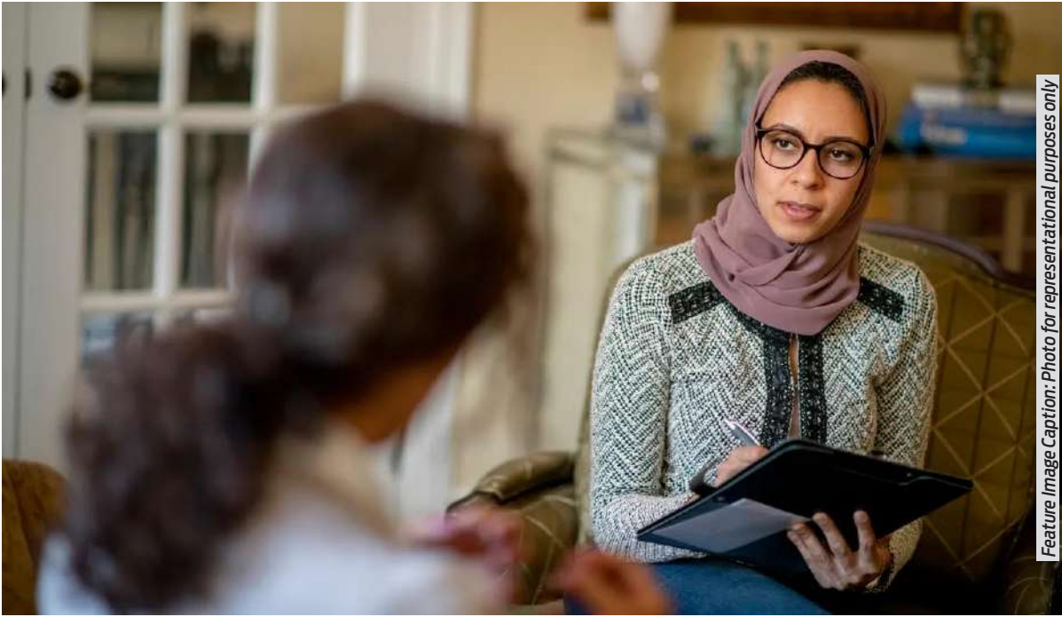
Feature Image Caption: Photo for representational purposes only

Another important role that clinical psychologists can play as mentors is helping teenagers develop a sense of purpose and direction. Adolescence is a time of transition and exploration, and many teenagers struggle to find their place in the world. Clinical psychologists can help teenagers clarify their values