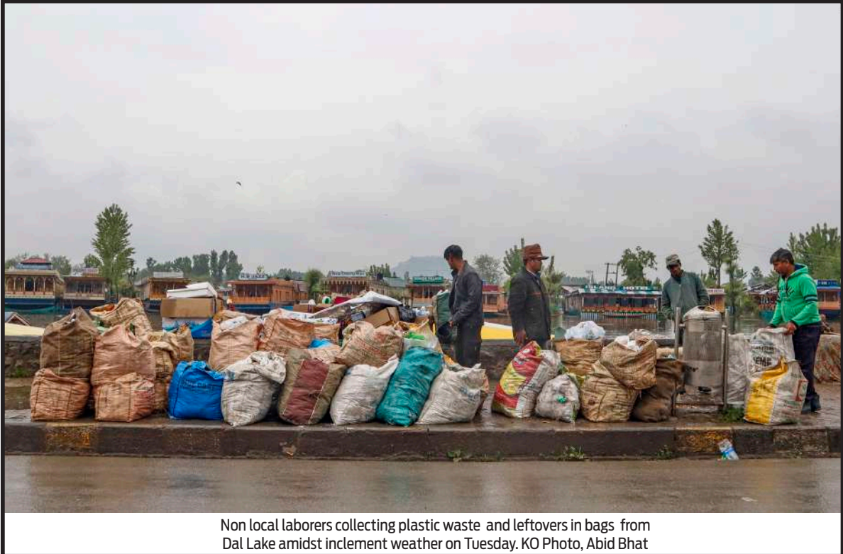
Non local laborers collecting plastic waste and leftovers in bags from Dal Lake amidst inclement weather on Tuesday.