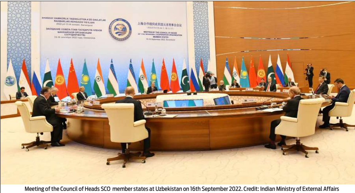
Meeting of the Council of Heads SCO member states at Uzbekistan on 16th September 2022.

“In the recent past India has doubled its focus on infrastructure near the border with China, to correct its earlier miscalculations. January 2023 saw the Indian defence minister inaugurating 27 infrastructure projects aimed at strengthening the border infrastructure, in addition India is speeding up the construction of 37,500 miles of roads, 350 miles of bridges, 19 airfields and a few tunnels in border areas or nearby