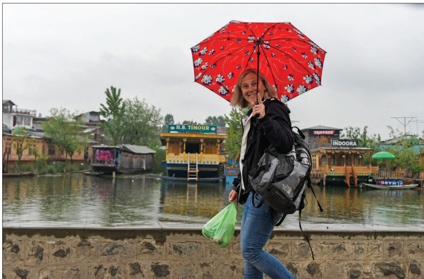
A foreigner lady smiles while walking along the Boulevard Road in Srinagar on a rainy Tuesday afternoon.

The complainant's lawyer opposed Singhvi's prayer for interim relief to Gandhi, sentenced to two years in jail by the trial court in Surat, and said if the disqualified MP cannot apologise for his