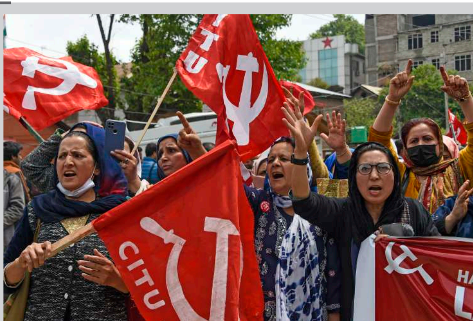
WOMEN PROTESTERS SHOUT SLOGANS demanding the implementation of the Minimum Wages Act in letter and spirit while abolishing the contractual system of employment, during a rally at Srinagar's Press Enclave on Monday.

Meeting was attended by SSP Traffic, ADC Baramulla, Addl SP Baramulla, JDP, SDM Gulmarg, ACD, ACP, SE R&B, PHE, ARTO and other concerned officers.