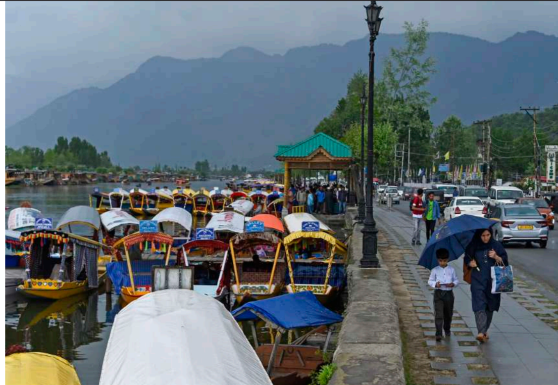
A woman on Boulevard Road in Dal Lake, covers her kid under umbrella as rains lash parts of the valley including Srinagar on Wednesday

During the inspection, he was briefed by CEO SSCL regarding site wise physical status and was assured that finishing touches will be given