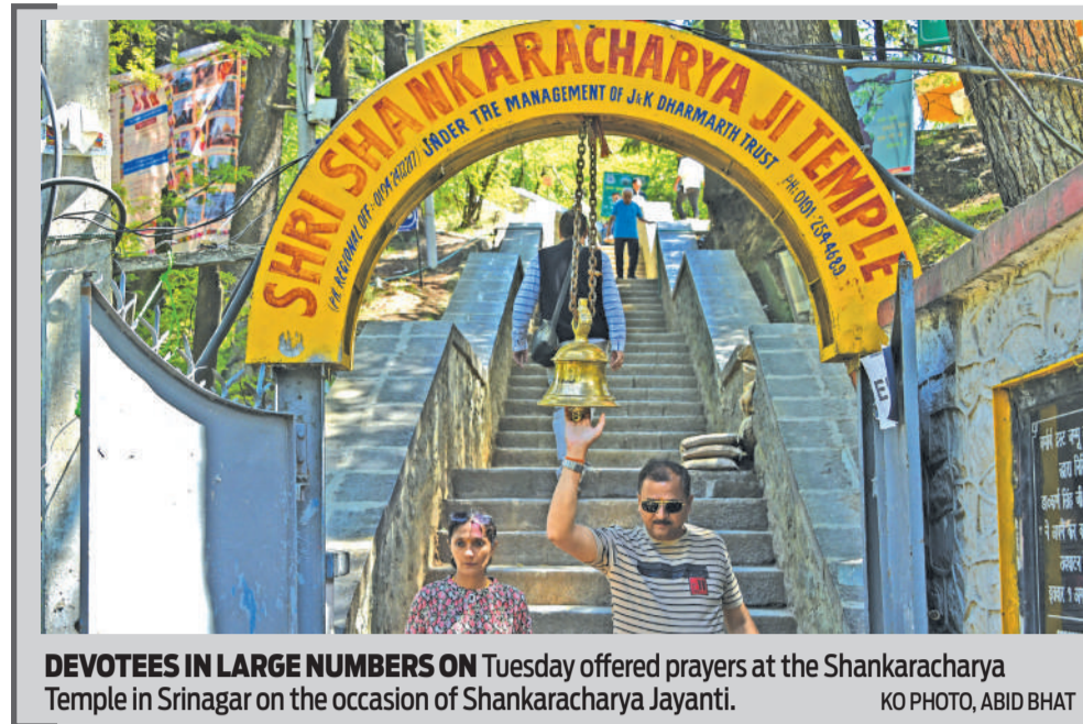
DEVOTEES IN LARGE NUMBERS ON Tuesday offered prayers at the Shankaracharya Temple in Srinagar on the occasion of Shankaracharya Jayanti.