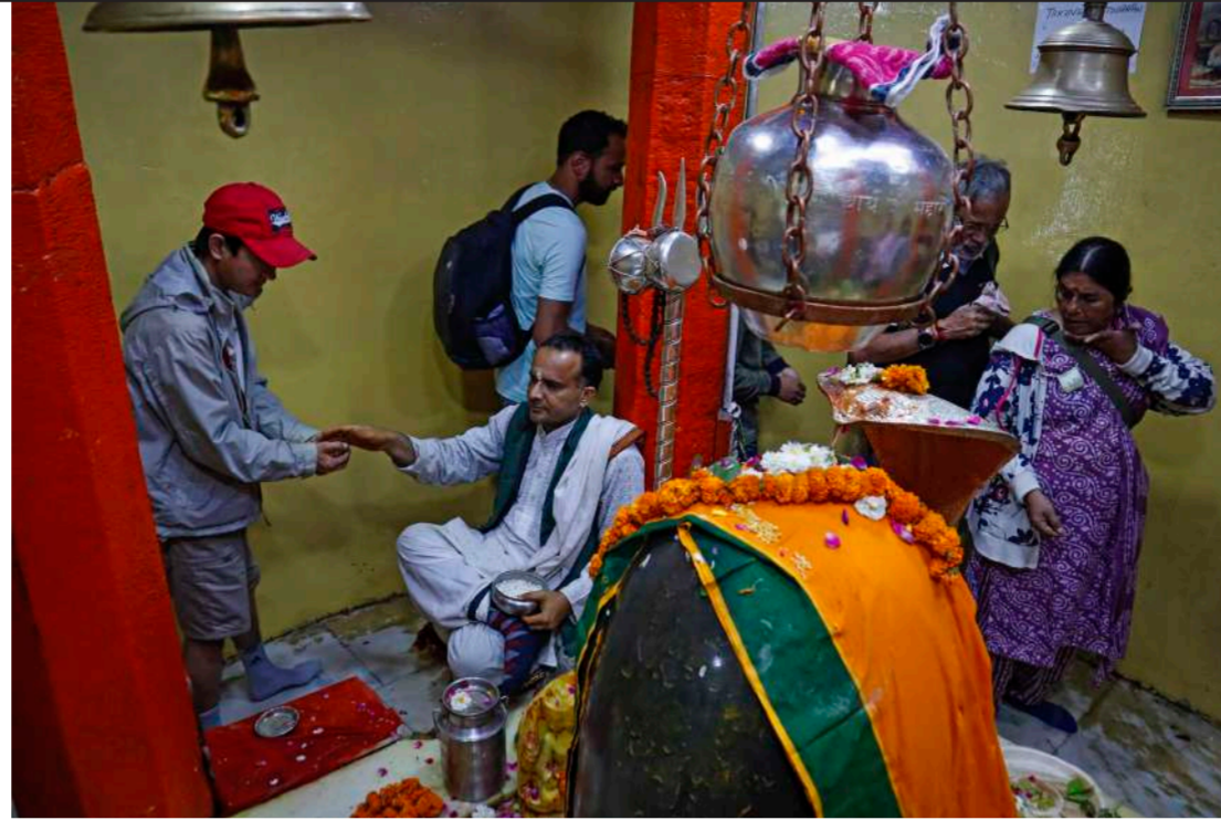
Special puja organized at Shankaracharya Temple in Srinagar on the occasion of Shankaracharya Jayanti on Tuesday

Similarly, the power supply to the receiving station Rajbagh shall remain affected 28 April from 11 am to 5 pm.