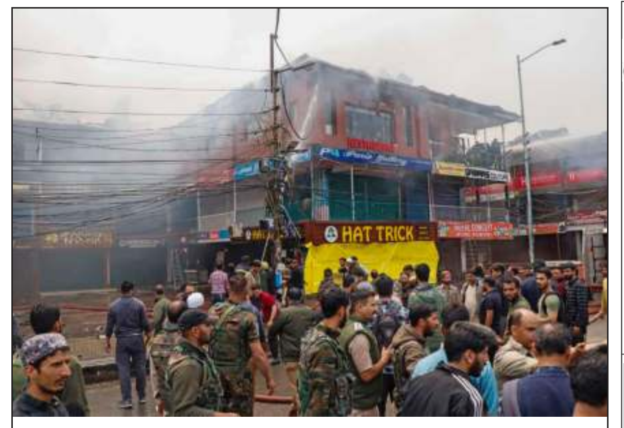
Massive Fire Engulfs Shopping Complex In Hazratbal

said speaking on anonymity. "There is no room for grade improvement as it's a screening test, so the students who scored below 172 even after qualifying the exam and getting the provisional registration certificate from the Medical Council are unaware about the future." He added.