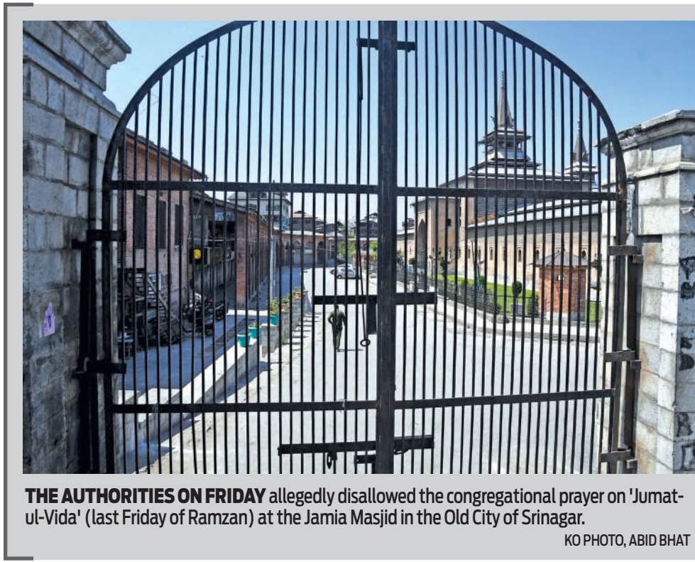
THE AUTHORITIES ON FRIDAY allegedly disallowed the congregational prayer on 'Jumatul-Vida' (last Friday of Ramadan) at the Jamia Masjid in the Old City of Srinagar.

Div Com along with DC, SSPADDC and local PRIs inspected the stalls exhibiting local products and cuisines and other recreational activities like river rafting, beach volleyball, rapling, zip-line, traditional wrestling (Dangal), Tug of War, and day-night cricket matches which were organised as part of the Utsav.