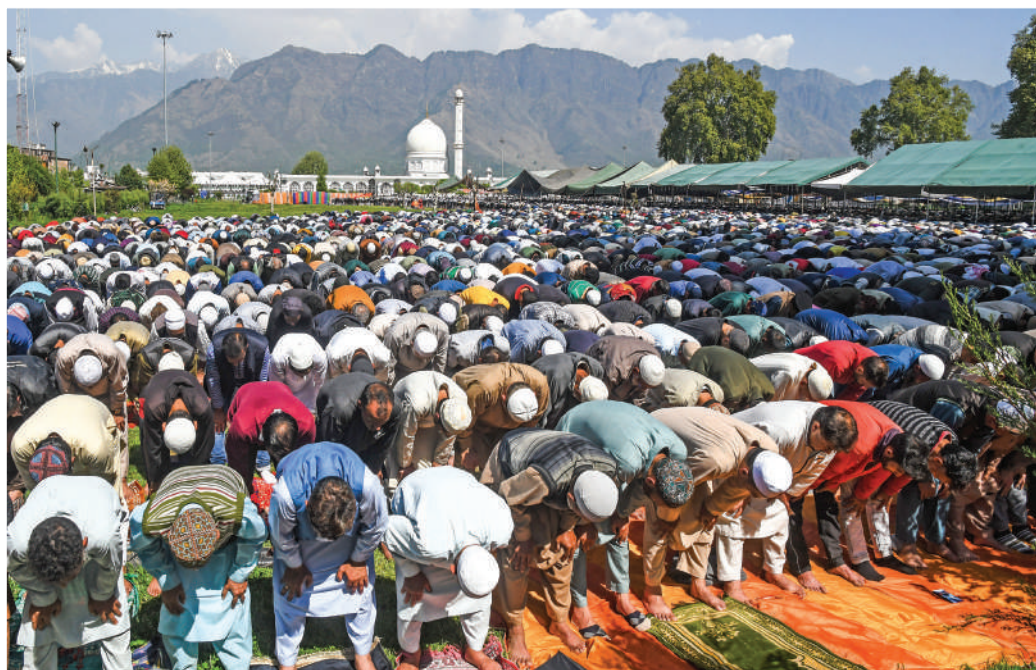
Thousands of faithful offered congregational prayers on 'Jumat-ul-Vida' (last Friday of Ramzan) at the Hazratbal shrine in Srinagar.

Emotional scenes were witnessed when Imam-Hi or chief cleric of Hazratbal shrine displayed the holy relic after congregational prayers. Devotees, many with moist eyes, raised their hands in supplication