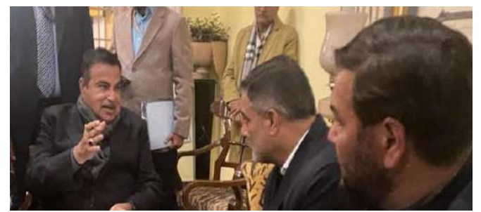
Observer News Service

DDC Chairman Budgam Leads The Delegation