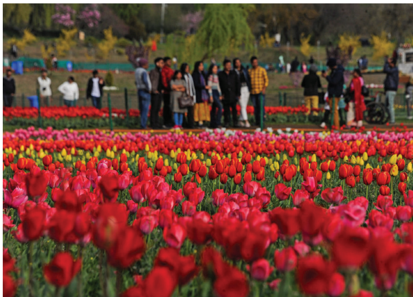
ASIA'S LARGEST TULIP GARDEN , located on the foothills of Zabarwan mountain range is in full bloom, drawing thousands of visitors every day from the country and abroad.

Observing that the tourism potential of Jammu is unique in many ways, the LG said with breathtaking natural beauty, rich cultural heritage, magnificent cuisine and warm hospitality, it can create a niche for itself on the global tourism map and administration is committed to ensure all the necessary infrastructure & resources. "As a 'Tourism Mission' initiative 75 new destinations, 75 Sufi/religious sites, 75 new cultural, heritage sites and 75 new tracks are being developed in J&K UT to open up new economic avenues for fulfilling the aspirations of the people," he said. "Development of water parks at twin cities of More on P6