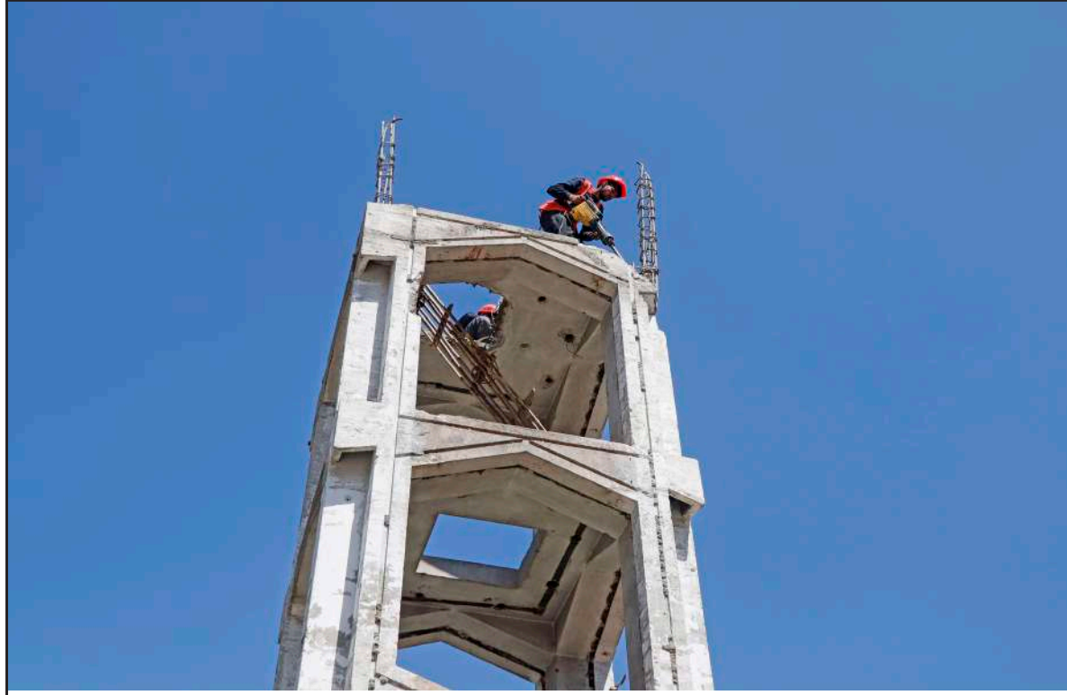
Historic Ghanta Ghar (Clock Tower) undergoes major facelift under Srinagar Smart City Project