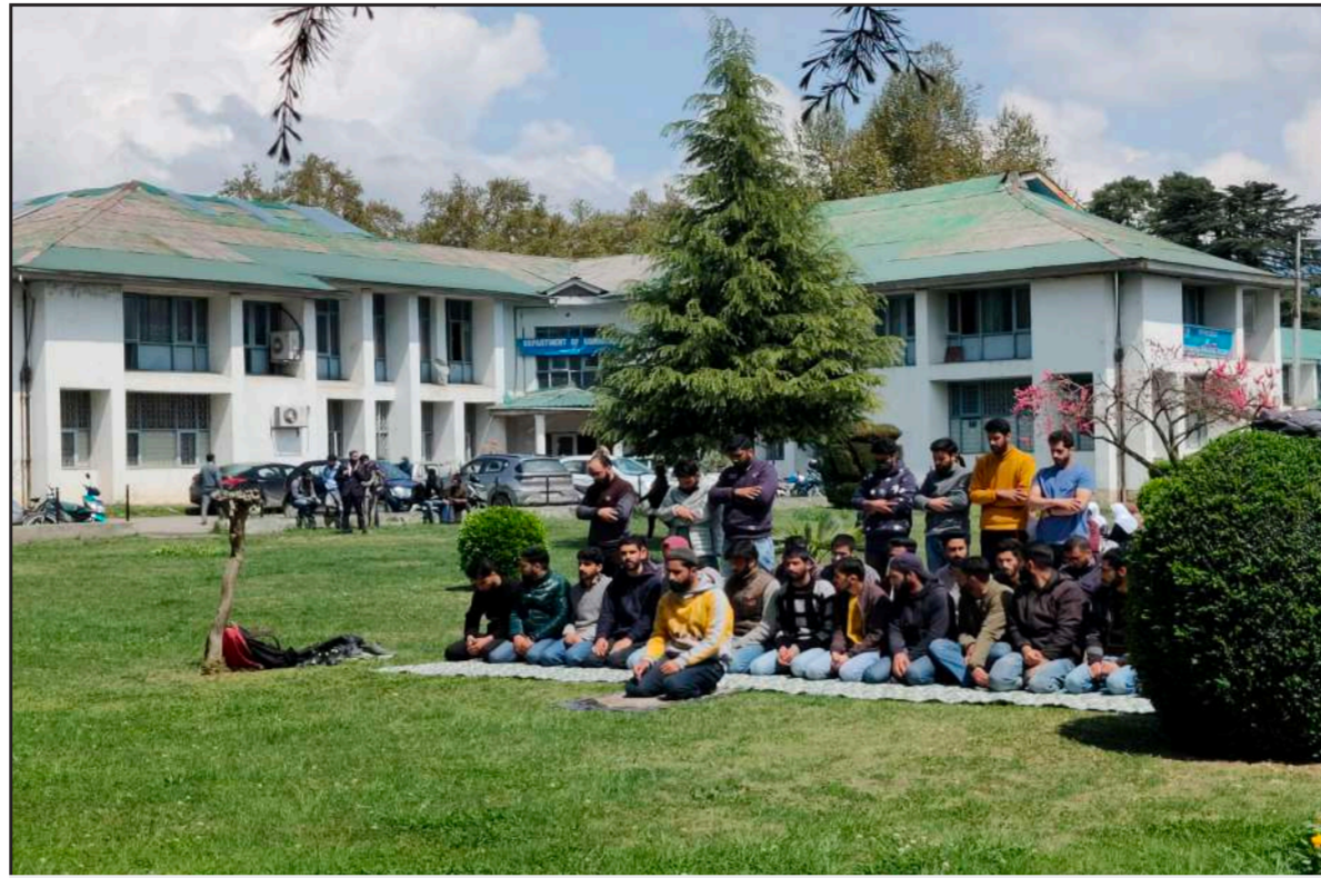
Students of Kashmir University offer Zuhr prayers in the lawns of campus on 15th day of the holy month of Ramazan on Thursday.

According to Shia fiqh Zakat-ul-fitr must be paid by the head of the family on behalf of his dependents, including servants, and/or dependent relatives who are fed in his house. If a Muslim or even a non-Muslim guest arrives at someone's house after sunset of the night preceding the Eid-ul-Fitr and dines with his host, it is incumbent on the latter to pay for the former's fitra.