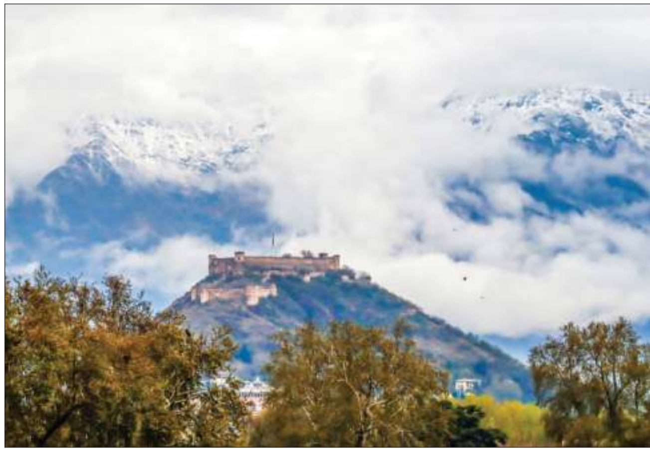
A MESMERIZING VIEW of snow capped Zabarwan mountain range on Tuesday.

Pertinently, the Eid prayers have not been allowed at Eidgah since the abrogation of Article 370 in Jammu & Kashmir on August 05, 2019 as authorities were apprehensive of law-and-order problems.