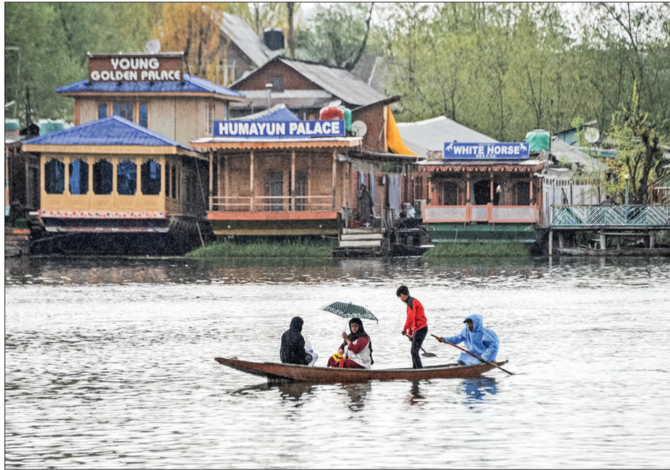
A boatman ferries a family to their houseboat inside Srinagar's Dal Lake on a rainy Monday afternoon.