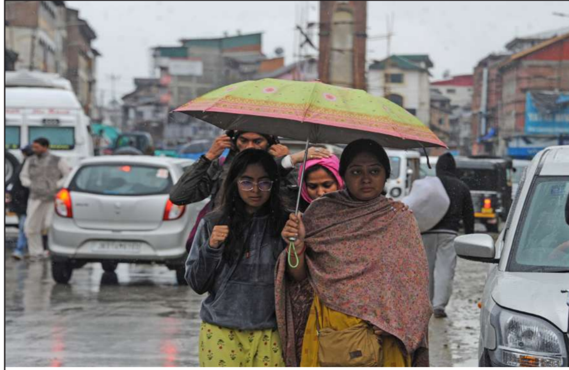
Female tourists takes cover under umbrella amid rainfall in city center Lal Chowk on Moday, KO Photo Abid Bhat