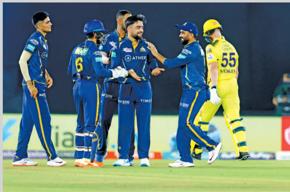
IPL 2023: GT'S RASHID KHAN celebrates after dismissing CSK debutant Ben Stokes in the opening match of the 2023 IPL season at Narendra Modi Stadium in Ahmedabad, Gujarat. GT won the toss and chose to bowl first, however, CSK managed to score a competitive total of 178/7. Opening batter Ruturaj Gaikwad smashed 90 (50) to top score for his team.

The only possibility will be that PCB will have to bear the entire costs, including logistics of the broadcasters in order to host matches in their country.