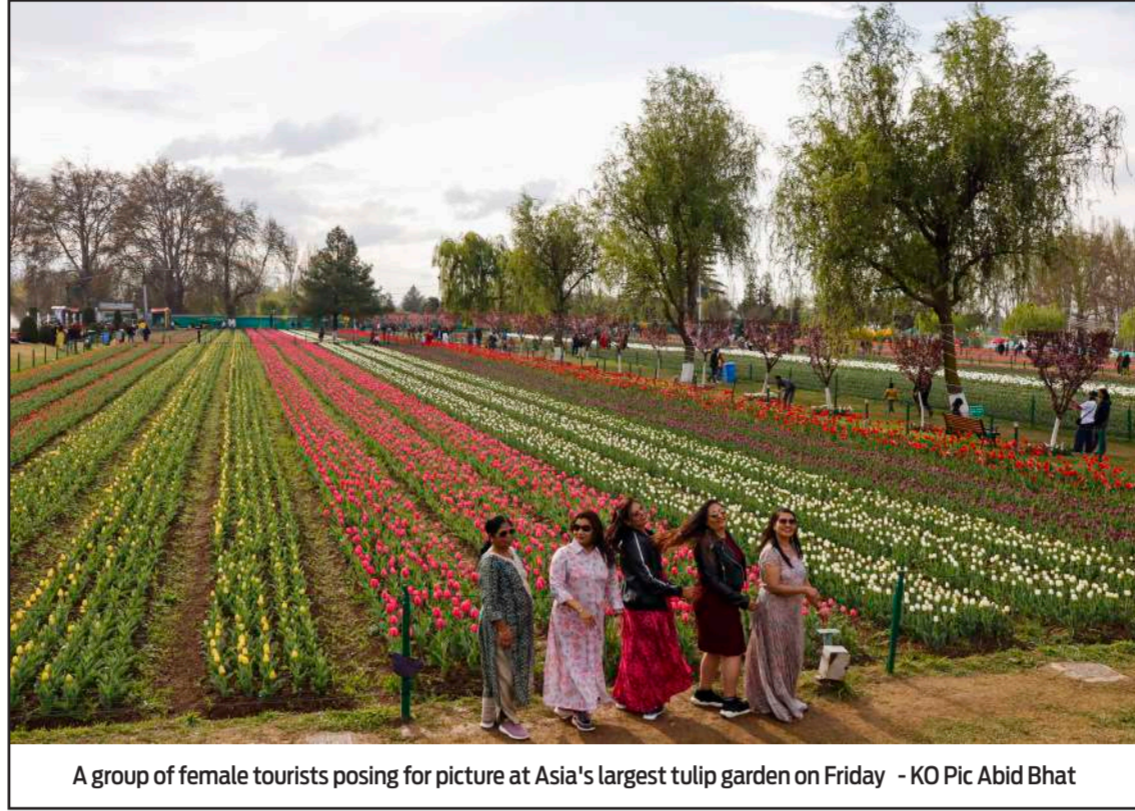
A group of female tourists posing for picture at Asia's largest tulip garden on Friday

The government should employ a multi-pronged approach that includes robust awareness, counselling and state of the art rehabilitation centres, the leaders said. "There is a need to address the underlying maladies that push our skilled, and educated youth towards drug addiction. Unemployment, and insecurity that is wearing down our youth, have to be addressed on a priority basis.