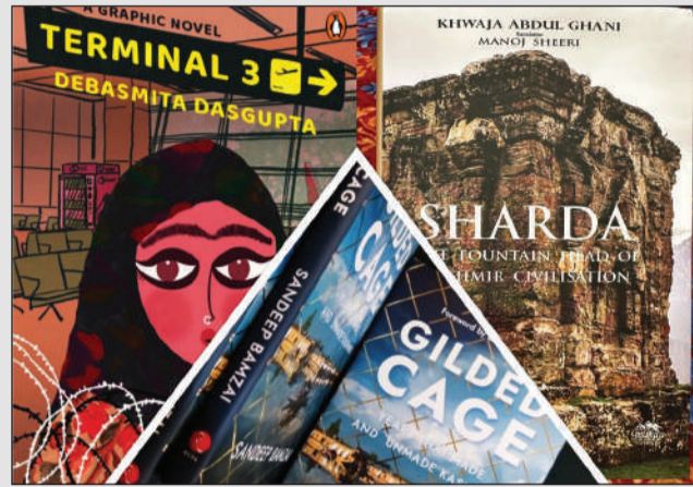
the books notes Jawaharlal Nehru's understanding of the valley as a shop-window for his brand of secular politics

From Jinnah's Kashmir interest to Sheikh Abdullah's vehement hatred for the former,