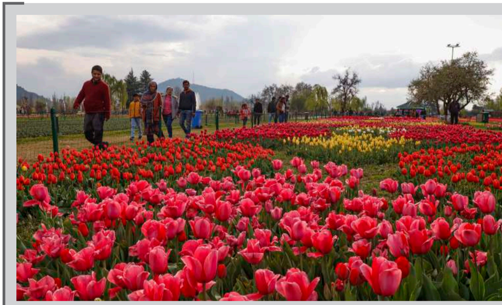
IN THE LAST 10 DAYS, OVER 1 LAKH PEOPLE from the country and abroad have visited Asia's largest Tulip Garden in Srinagar, where tulip flowers are in full bloom.

"Recently launched Intelligence Traffic Management Surveillance System (IIMSS) at present plays an important role in stopping wrong parking, rash driving, seat belt or helmet gives the scientific evidence of the wrong action of vehicle owners and attracts online challan," the ASP said.