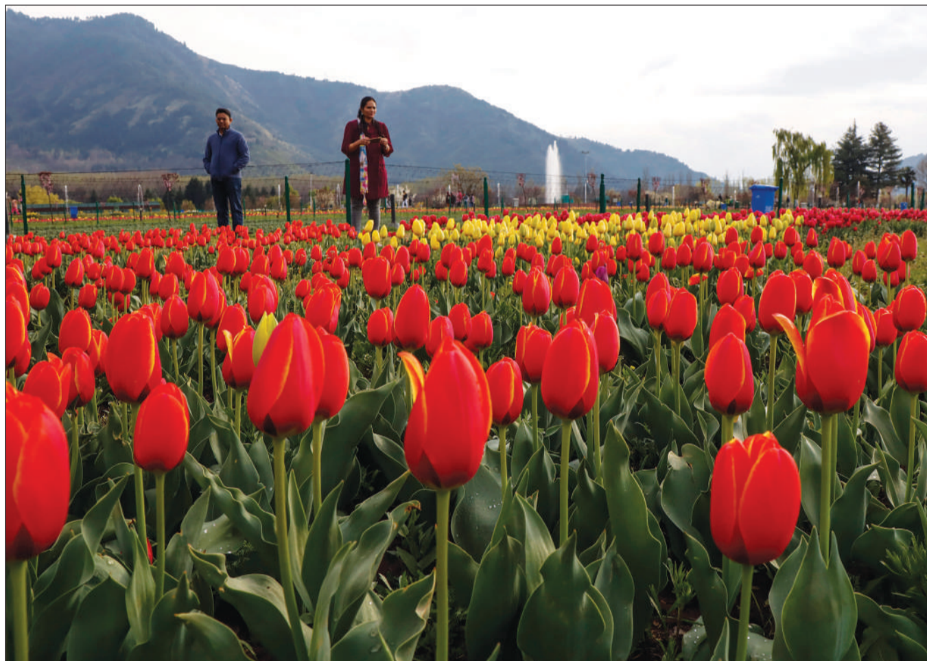
Located on the foothills of the Zabarwan range, Asia's largest tulip garden in Srinagar is in full bloom, attracting thousands of visitors daily from the country and abroad.

"The draw of lots through random digital selection More on P6