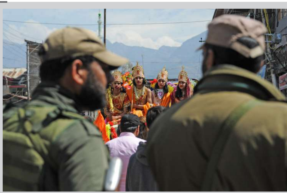
AMIDST TIGHT SECURITY, members of Kashmiri Pandit community on Thursday celebrated Ram Navami in this capital city by taking out a Shobha Yatra.

He and his associates have been booked under several criminal cases related to spreading disharmony among classes, attempt to murder, attack on police personnel and creating obstructions in the lawful discharge of duty by public servants