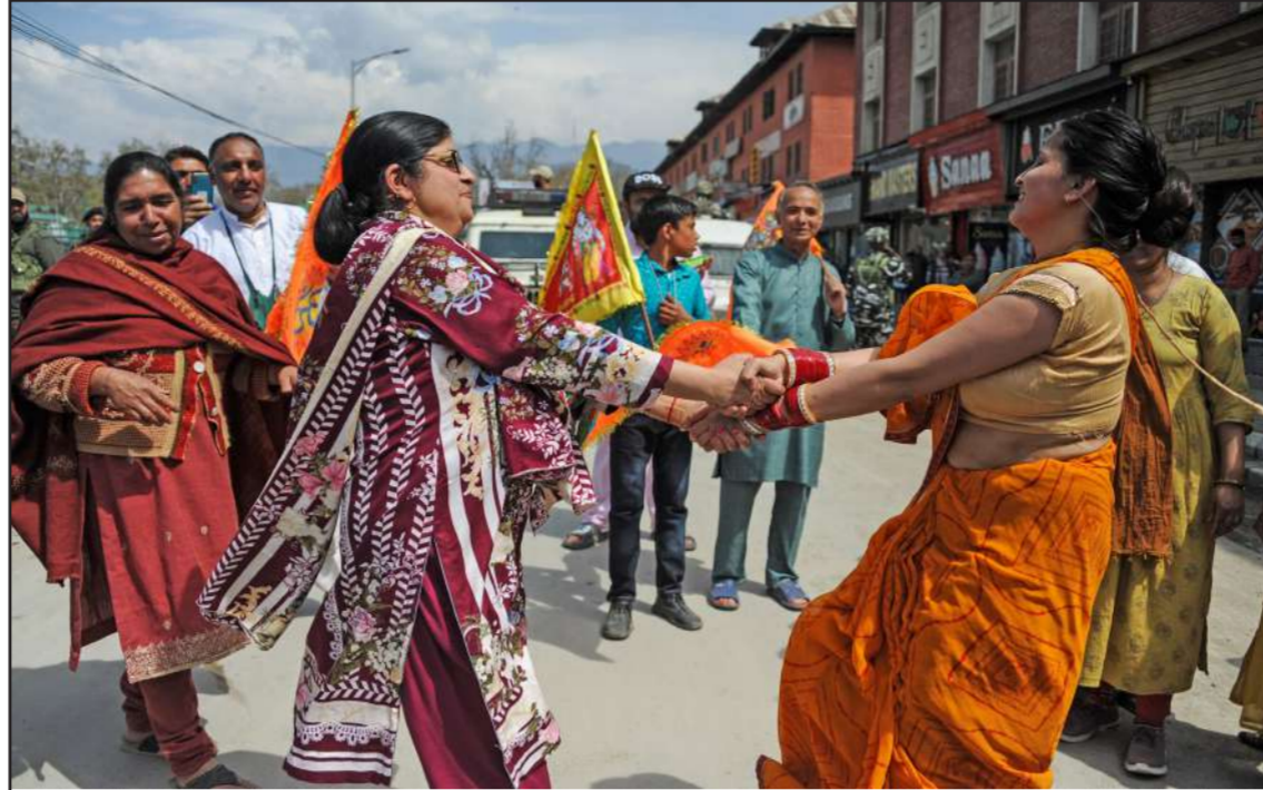
Kashmiri Pandit women performing folk dance (Hikkat) during Shobha Yatra on the eve of Ram Navami at city center Lal Chowk on Thursday

Apart from that NIT Srinagar has also secured 28th rank among top 100 technological colleges both in private and government category run institutions in the country. Similarly, NIT Srinagar has also secured 9th rank in north Indian engineering government colleges.