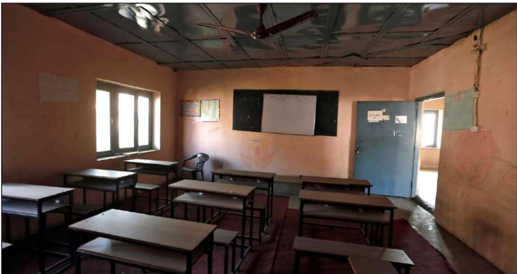
Feature image caption: An empty government school in Srinagar

The reason behind such behavior exhibited by teachers could stem from a myriad of causes.