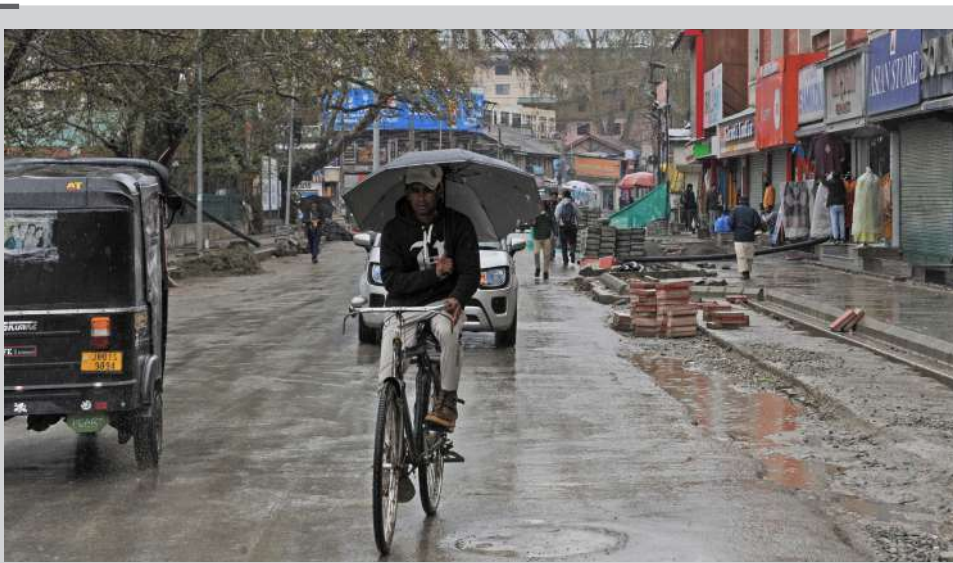
A YOUTH CARRYING UMBRELLA rides his cycle through busy Residency Road in Srinagar on a rainy day Saturday.

"The Commission may appoint or designate electricity ombudsman or ombudsmen separately for each licensee or a common electricity ombudsman or ombudsmen for two or more distribution licensees considering factors such as the number of representations received, disposal of representations within the specified time limit, ease of access for the consumers and the geographical area," the regulations further state. —(KNO)