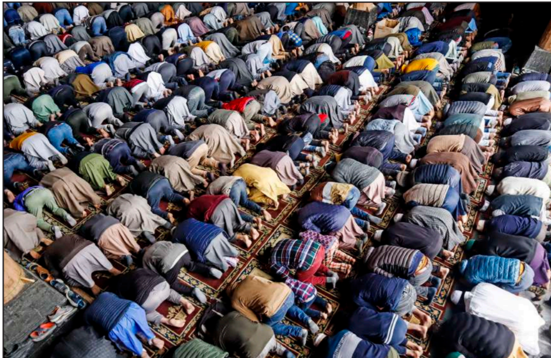
Devotees in thousands throng central Jamia Masjid in Srinagar to offer congregational prayers on the first Friday day of the holy month of Ramazan.

He said 18,506 cases of tuberculosis have been reported in Kashmir in the last five years. In 2018, 4,774 TB cases were recorded in J&K. In 2019, it was down to 4,080 TB cases, he said, adding that due to less screening because of Covid-19 Kashmir reported 2,840 cases.