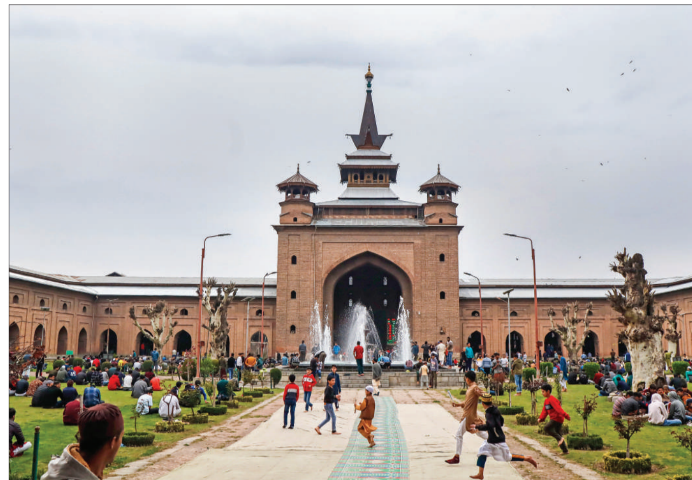
Children having fun time inside Srinagar's Jamia Masjid, where thousands of devotees offered congregational prayers on the first Friday of the holy month of Ramazan

On Wednesday, the Ahmedabad city crime branch lodged a case of cheating (Indian Penal Code section 420), criminal breach of trust (406), criminal conspiracy (120-b) and personating a public servant (170) against the alleged conman, said Deputy Commissioner More on P6