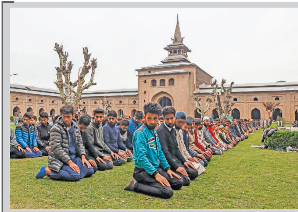
THOUSANDS OF DEVOTEES OFFERED congregational prayers at Jamia Masjid in the Old City on the first Friday of the holy month of Ramadan.

"In the next three years, 38,880 teachers and supporting staff will be recruited for 740 Eklayva Model Residential Schools. Railways have also been allocated Rs. 2.4 lakh crores in the FY 2023-24", the Minister added.