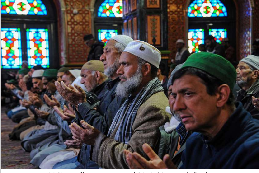
Wrshippers offer prayers at a revered shrine in Srinagar on the first day of Ramadan on Thursday

During the meeting, it was informed that the bus service will be available upto 10 PM in night.