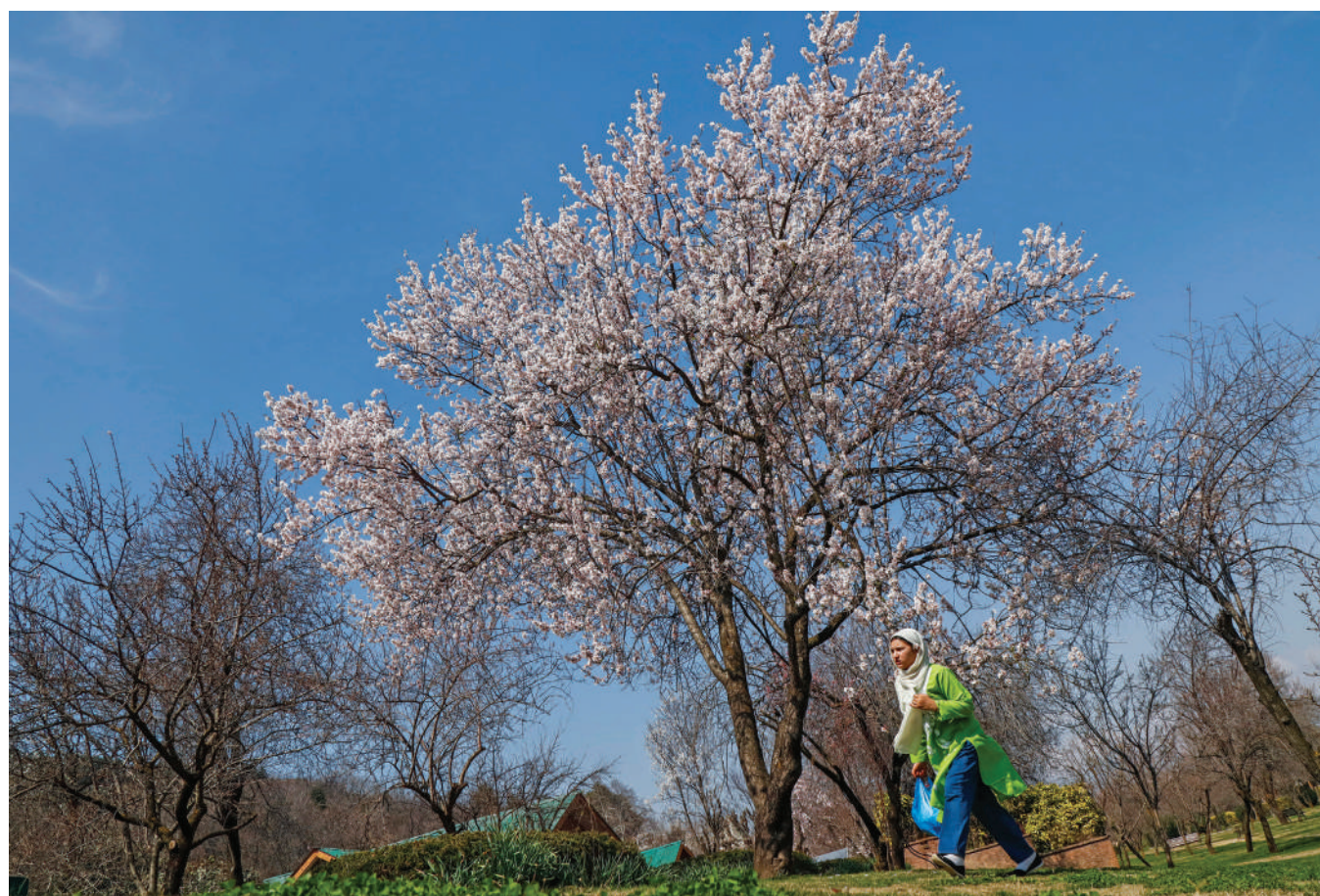
A girl walks under the blooming almond trees inside the majestic Badamwari garden in Srinagar on a bright sunny morning.

The two-page memorandum has as its signatories NCP leader Sharad Pawar, Congress president Mallikarjun Kharge, CPI(M) general secretary More on P6