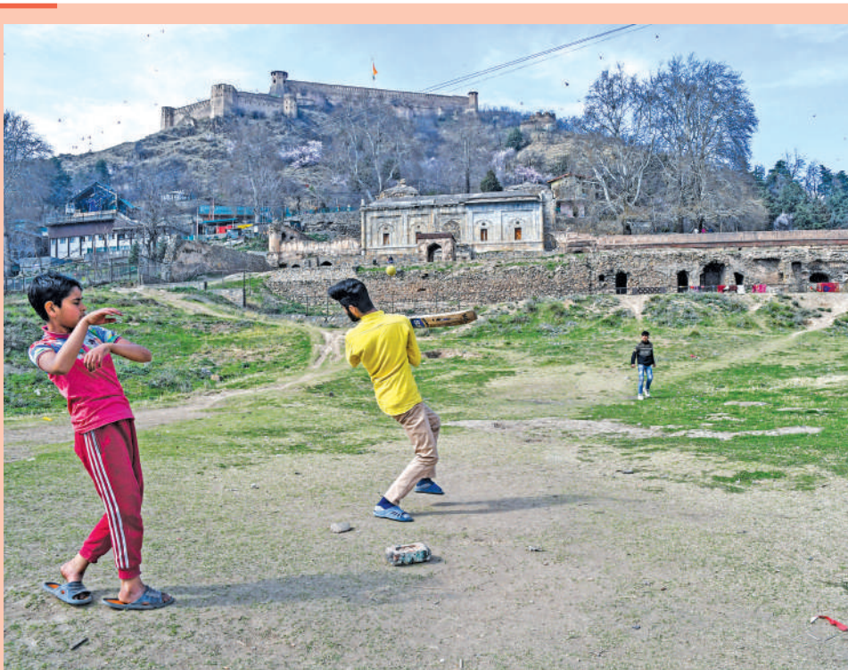
YOUNG BOYS PLAY cricket as some of Srinagar city's most historic places loom in the foreground.