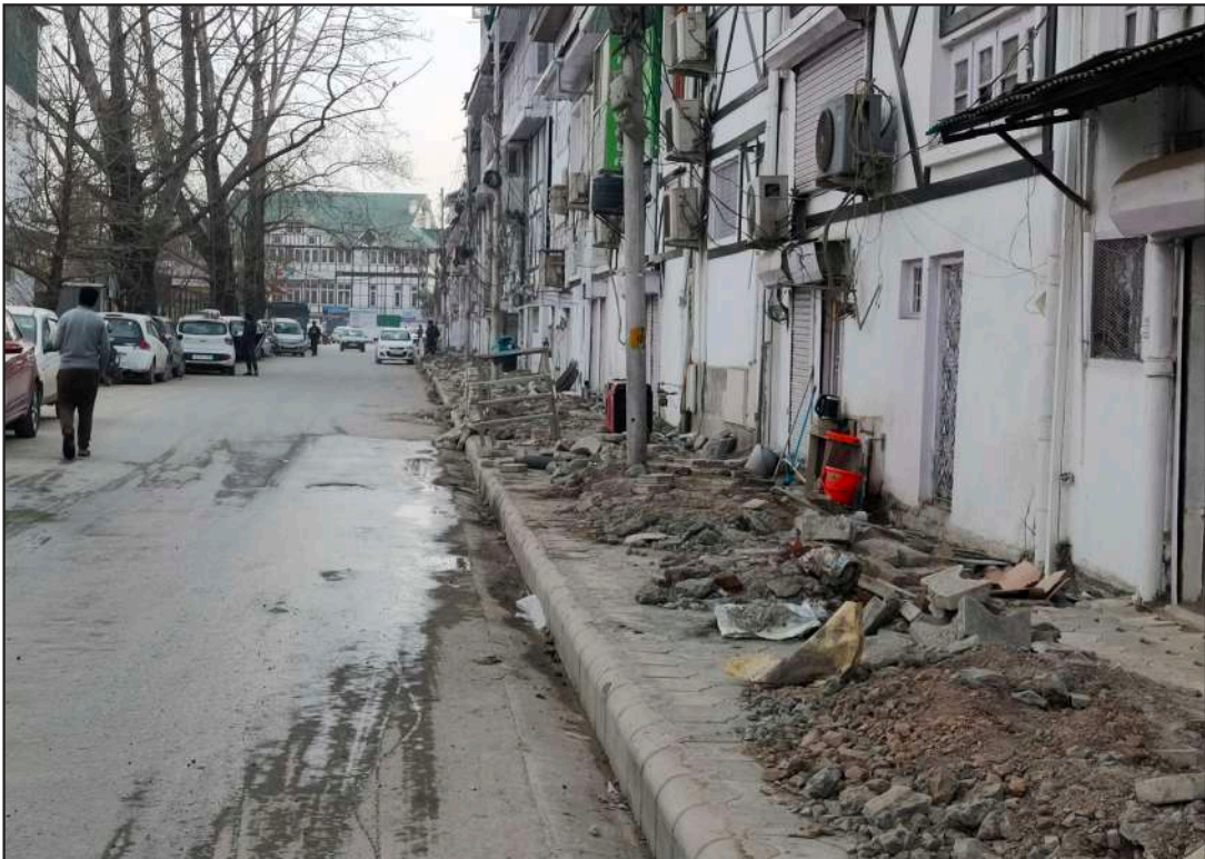
CURRENT AFFAIRS: Months after beautifying Polo View stretch, authorities dismantled tiles to lay underground power lines.