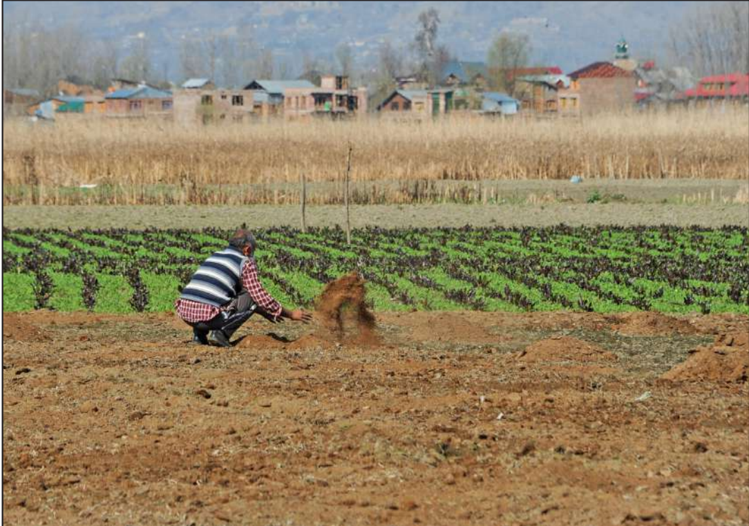
Man works in a paddy field on a sunny day in Srinagar outskirts on Saturday