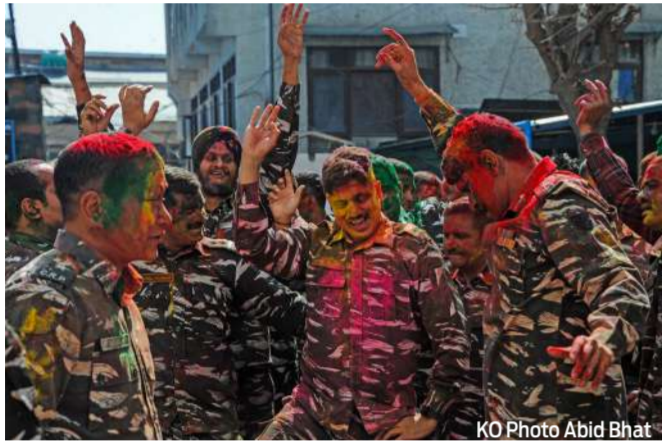
KO Photo Abid Bhat

"CRPF is generally referred to as mini-India, we come from different backgrounds, different religions, caste, creed, languages, but when we put on this uniform, our identity is this uniform.