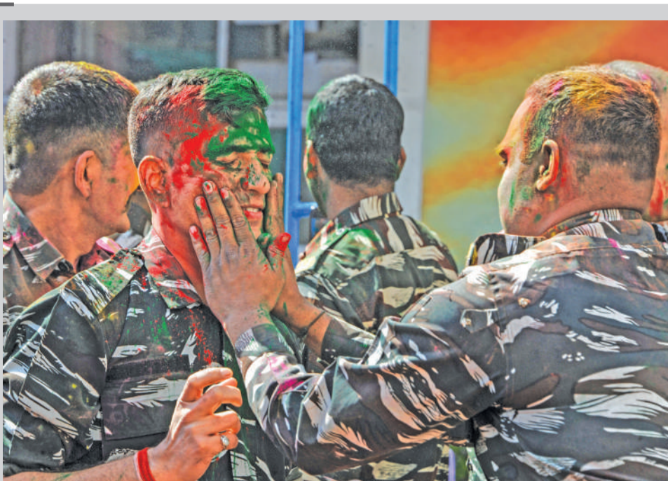
CRPF PERSONNEL CELEBRATING the festival of Holi at their camp in Srinagar on Wednesday.

As per the notification, the condition for the death of a child soon after birth may be defined as up to 28 days after birth. A baby born with no signs of life at or after 28 weeks of gestation may be defined as stillbirth and the benefit of Special Maternity Leave shall be admissible only to a woman employee with less than two surviving children, it reads. —(KNO)