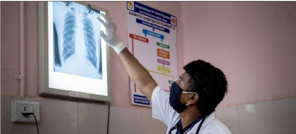
Feature image: Photo for representational purposes only.

Spread of the Disease: The disease is highly contagious and can spread easily from person to person through the air when an infected person talks, coughs, or sneezes. This increases the risk of a TB outbreak and exacerbates the impact of the disease on the community. In addition, the lack of effective preventive measures and limited access to medical care