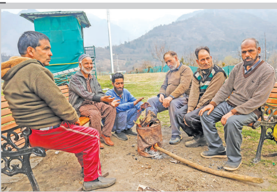
GARDENERS TAKE A SHORT BREAK to keep themselves warm on a rainy day Thursday inside Srinagar's Tulip Garden. .

"How can any school hike the fees unless it is approved by the Chairman of the FFRC? No school has any right to take a decision regarding the fee hike. We will not allow any school to take any such decision till the directions are given by the fee panel," said another parent.