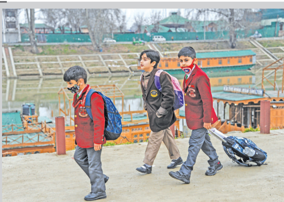
A STUDENT JOINED BY HIS CLASSMATES drags his bag while on his way to the school that reopened after three-month winter break on Wednesday.