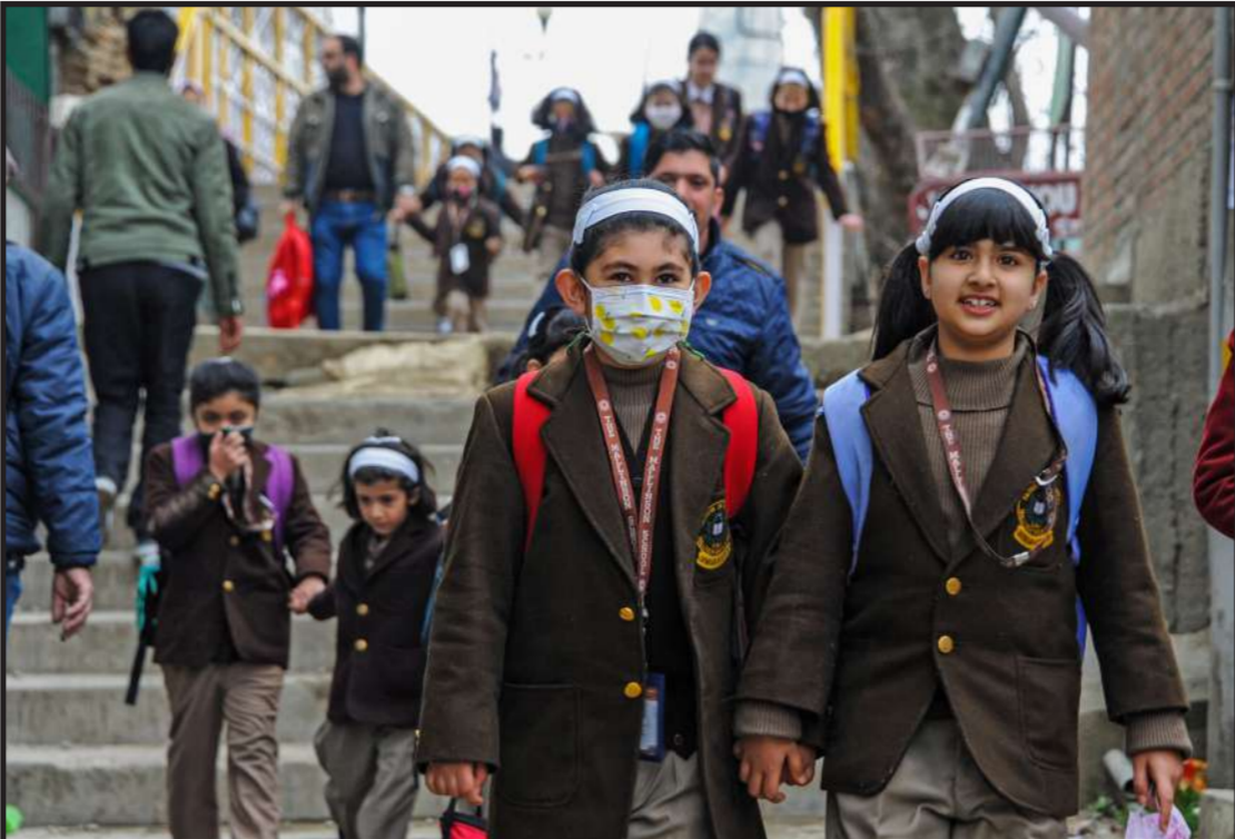
School children walk towards their school on Wednesday after more than two months of winter vacations.

On this occasion, Party President Syed Mohammad Altaf Bukhari said, "Apni Party has a distinction of being J&K's only political party that earned peoples' trust in a very short span of time after it was established on March 8 in 2020. We are grateful to the people of Jammu and Kashmir for having faith in us and trusting our straightforward and candid agenda even though some miscreants tried their best to spread propaganda against the Apni Party at the beginning. But just three years down the line the same people who tried to spread lies against the Apni Party are now ashamed by seeing that this party is gaining public support and acceptance with each passing day across the J&K."