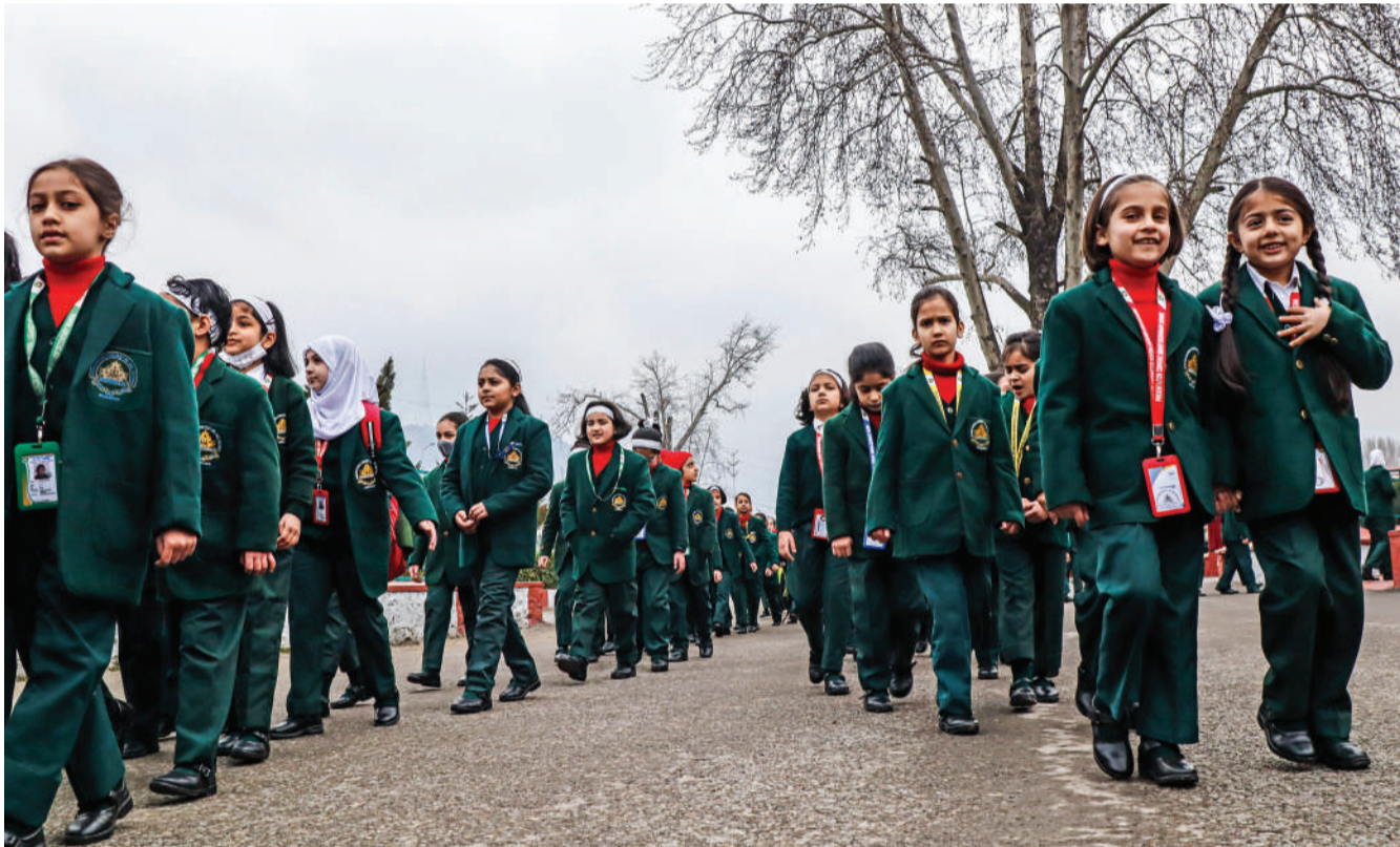
Students attended morning assembly in schools in Srinagar and elsewhere, as three-month long winter vacation came to an end on Wednesday.