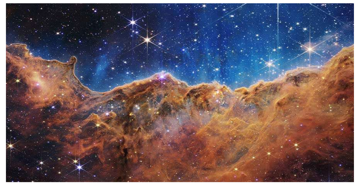
reliable discovery of many thousands of cosmic objects of classes, such as black holes, neutron stars, white