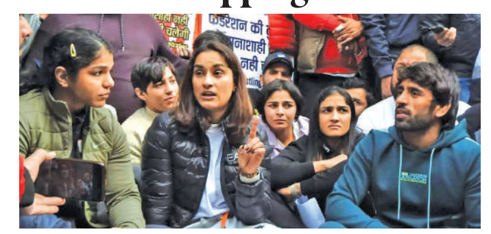
Press Trust of India

NEW DELHI: The Sports Ministry is apparently livid with the country's top wrestlers for opting out of international events in the wake of their ongoing standoff with the Wrestling Federation of India (WFI) and its chief Brij Bhushan Sharan Singh.