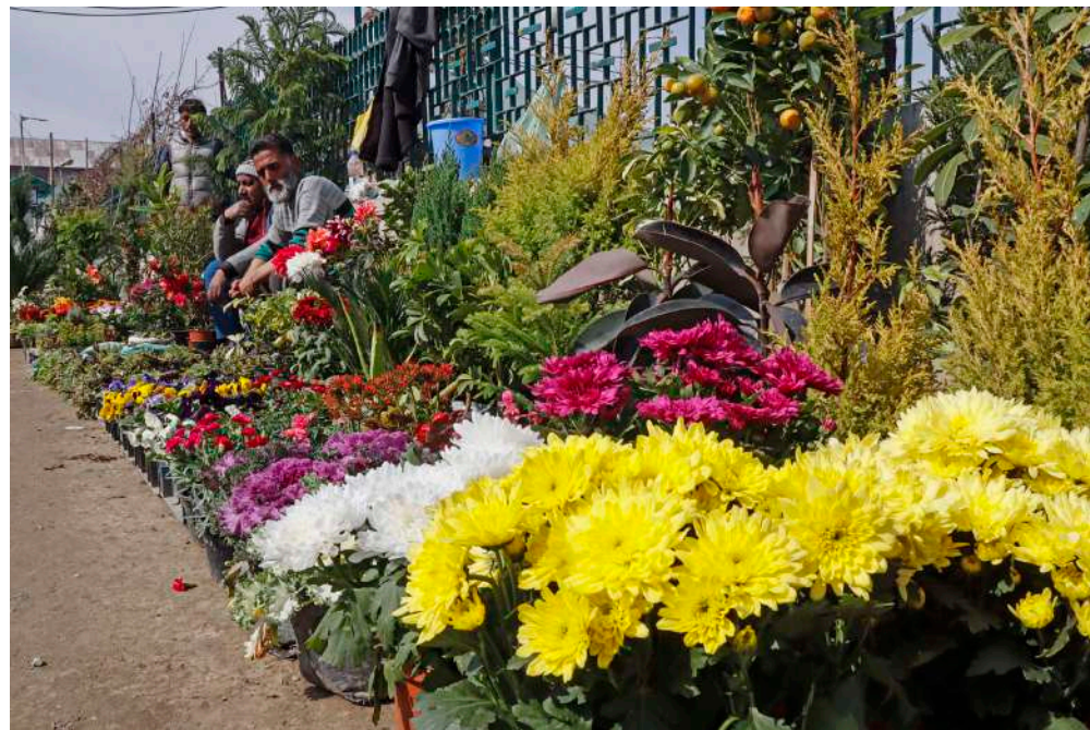
Harbingers of Spring! Roadside florists have set up stalls as Valley braces for early spring this year.