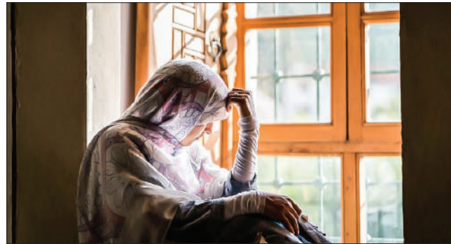
study which has been published in International Journal of Advanced Research (IJAR) in January 2023 discloses.

Around 31 among them were in the age group of 31-40. About 16 women out of 92 narrated that they have experienced domestic violence, the