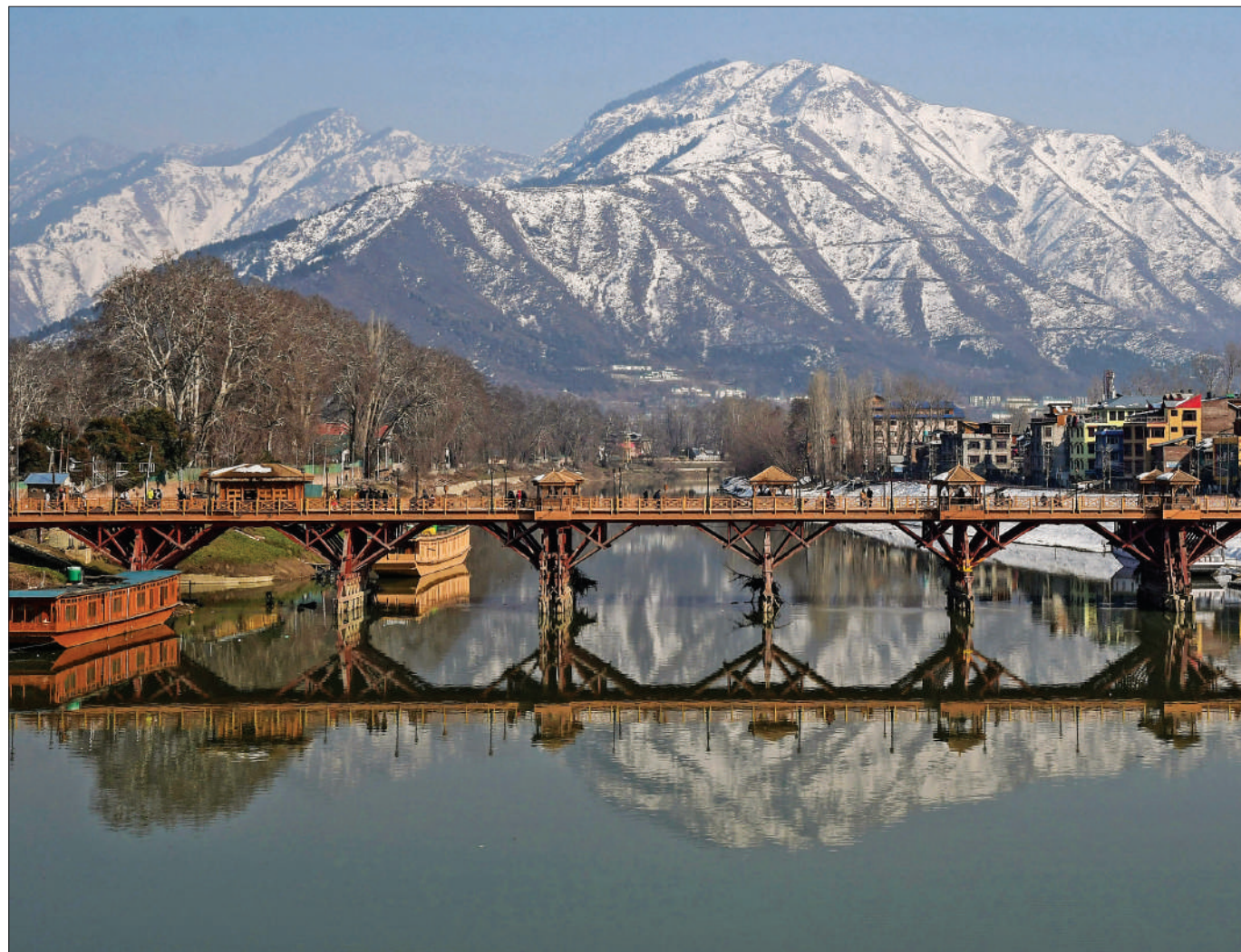
A view of snow-clad Zabarwan mountain range on a bright sunny day Monday.