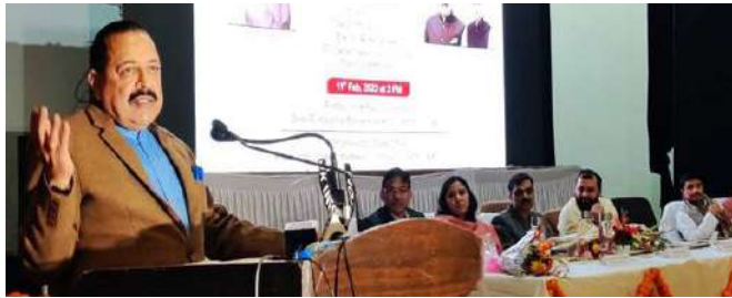
Press Trust Of India

JAMMU: Union minister Jitendra Singh on Saturday said Khadi is fast emerging as a new and lucrative start-up avenue, giving full credit to Prime Minister Narendra Modi for having popularized the fabric across the world.