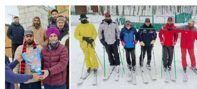
Observer News Service

BUDGAM: The Department of Youth Services & Sports (YSS) started its annual snow skiing training for the first batch of boys on the newly explored ski slopes of Yousmarg on Wednesday here.