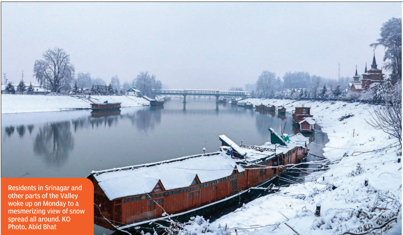
Residents in Srinagar and other parts of the Valley woke up on Monday to a mesmerizing view of snow spread all around.

weather affected air traffic to and from the Kashmir valley as flight operations at the Srinagar airport were suspended.