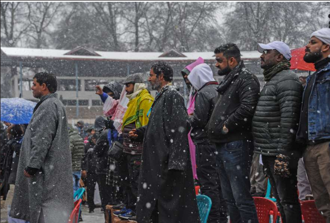
Braving heavy snowfall, supporters of the Congress party attend a rally led by Rahul Gandhi at SK stadium on Monday.

The Rehabilitation therapists pinned hope that the LG administration will come to their rescue and will order the creation of posts.