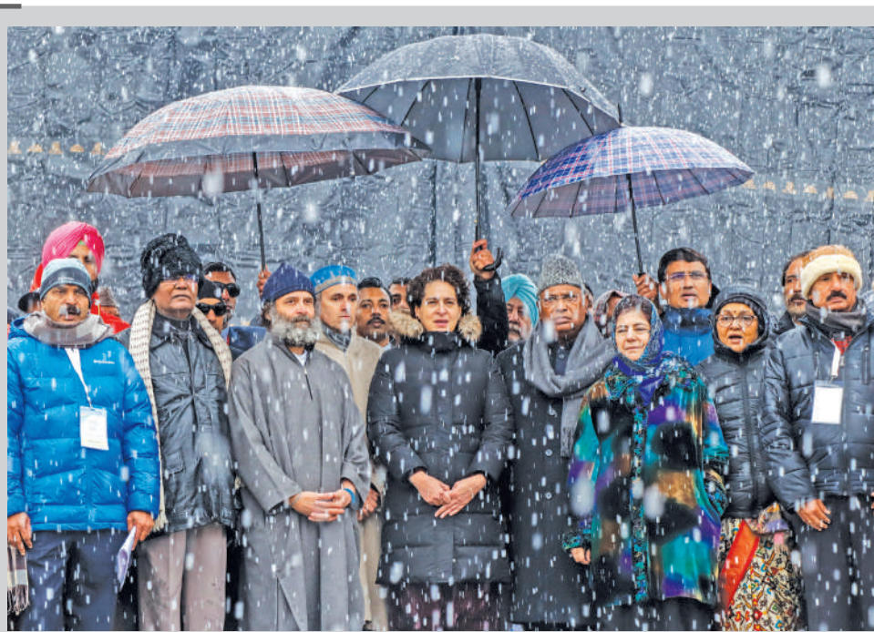
RAHUL GANDHI, HIS SISTER PRIYANKA and former J&K Chief Ministers Omar Abdullah and Mehbooba Mufti pose for a photograph amid heavy snowfall at the venue of Congress rally in Srinagar on Monday.

The outer wall, the main gate as well as the entry of the guardroom of the NC leader's Humhama residence was demolished as part of the government's ongoing demolition drive against the "land grabbers".